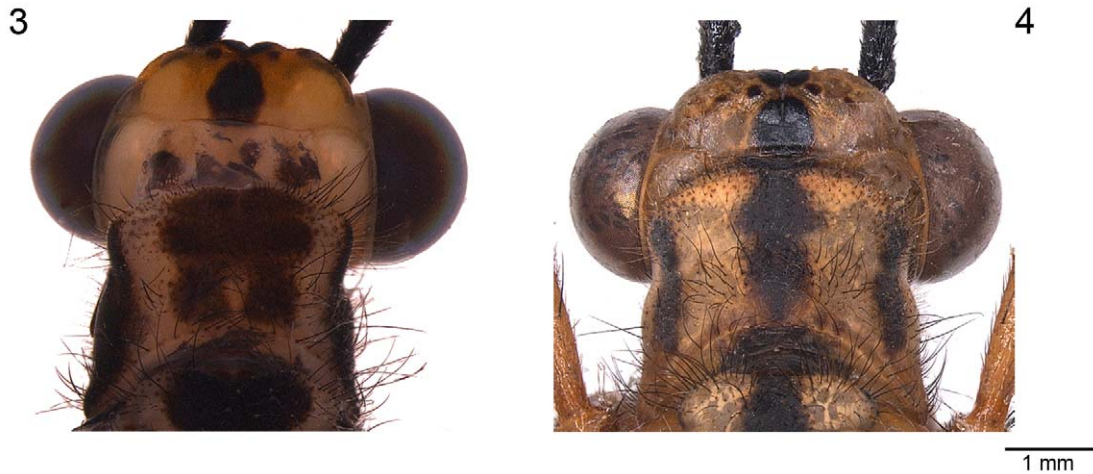
FIGURES 3–4. Pronotum of Megistoleon species. 3. M. ritsemae (Gabon, Ipassa), alcohol preserved specimen. 4. M. thaumatopteryx sp. nov. , holotypus, female (Mozambique, Sofala prov.).