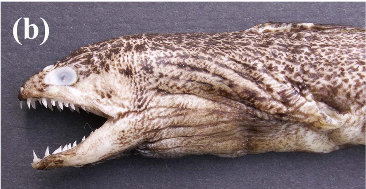
FIGURE 1. (a) Gymnothorax reticularis collected off the northern coast of Israel (TAU P. 14971); (b) Lateral view of head.

Counts and measurements: TL 460 mm, preanal 214, HL 60.4, Snout 8.7, ED 4.1, Upper jaw 20.2, Depth at gill opening 29.5. Body proportions: HL 7.6 in TL, preanal 2.15 in TL, depth at gill opening 15.6 in TL, snout 6.9 at HL, ED 14.7 in HL, upper jaw 3 in HL. HL 13.1% of TL, preanal 46.5% of TL, depth at gill opening 6.4% of TL, snout 14.4% of HL, ED 6.8% of HL, upper jaw 33.3% of HL. Vertebrae: pre-dorsal 6, pre-anal 50, total – more than 123. Since the tip of