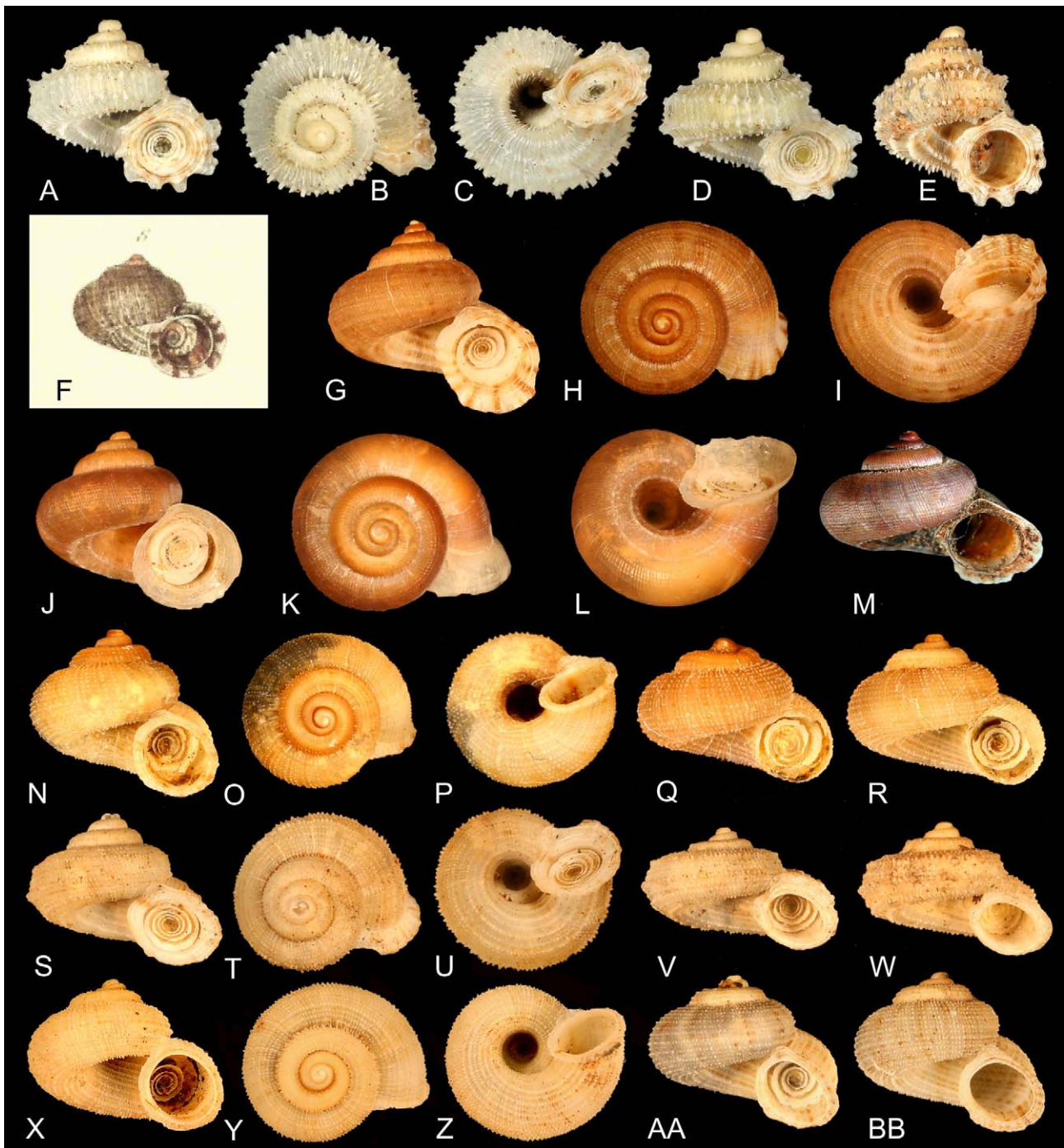
FIGURE 3. A–E. Abbottella (Abbottella) abbotti Bartsch, 1946. A–C. UF 215980, 5.6 mm width. D. UF 215983, 6.0 mm width. E. UF 215981, 5.2 mm width. F. Choanopoma adolfi Pfeiffer, 1852. Pfeiffer, 1854: pl. 48, fig. 8. G–I. Abbottella (Abbottella) cf. adolfi adolfi (Pfeiffer, 1852). GTW 7020c, 5 mm width. J–L. Abbottella (Abbottella) adolfi peninsularis Bartsch, 1946. GTW 9430a, 7.8 mm width. M. Abbottella (Abbottella) newcombi (Crosse, 1873). Syntype (MNHN 5436), 5.7 mm length. N–R. Abbottella (Abbottella) aenea Watters, 2010. N–P. GTW 14181a, 6.5 mm width. Q. GTW 14181a, 6.1 mm width. R. Paratype (OSUM 35490), 6.0 mm width. S–W. Abbottella (Abbottella) crossei (Pilsbry, 1933). S–U. GTW 9432a, 7.3 mm width. V. UF 216146, 7.6 mm width. W. UF 216146, 7.2 mm width. X–BB. Abbottella (Abbottella) milleacantha Watters & Duffy, 2010. X–Z. Holotype (UF 420728), 7.5 mm width. AA. Grego, 7.4 mm width. BB. Grego, 8.1 mm width.