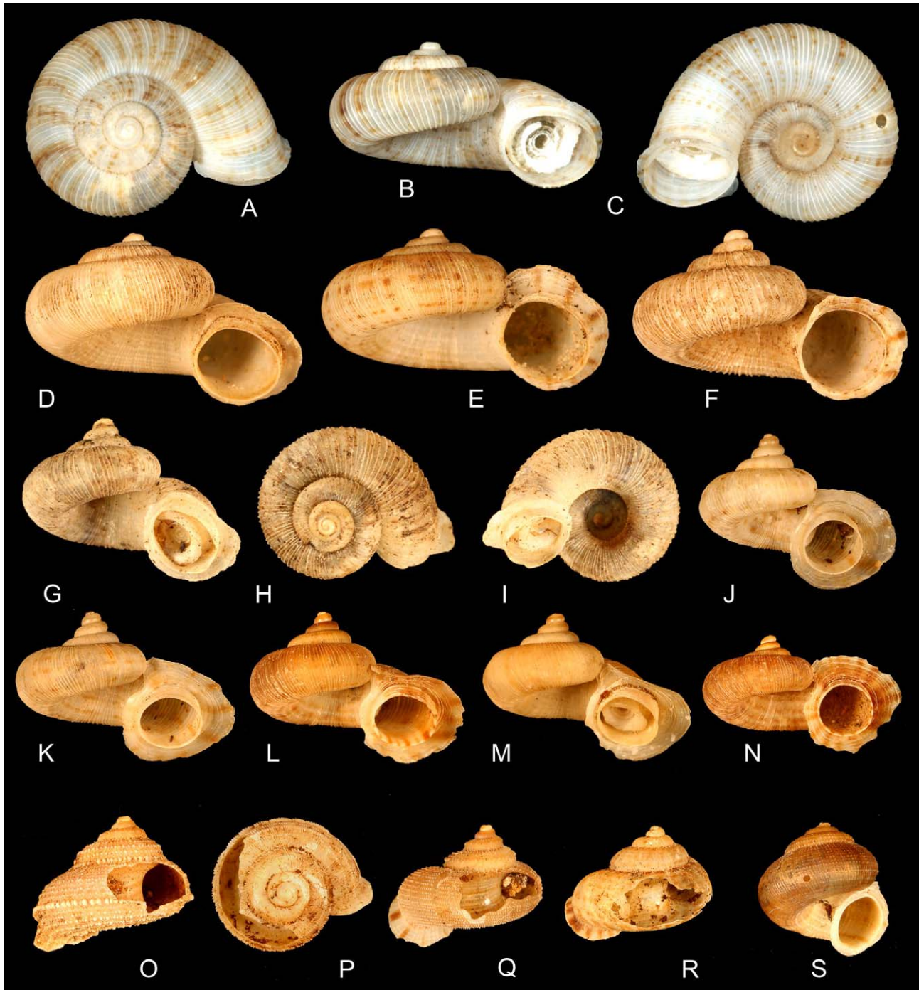
FIGURE 5. A–F. Rolleia haitensis Bartsch, 1946. A–C. Holotype (USNM 504088), 12.0 mm width. D. UF 32777, 15.4 mm width. E. UF 32777, 13.7 mm width. F. UF 32863, 13.2 mm width. G–N. Rolleia oberi Watters & Duffy, 2010. G–I. Holotype (UF 434775), 10.3 mm width. J. UF 236228, 10.2 mm width. K. UF 216195, 11.0 mm width. L. UF 216195, 11.5 mm width. M. UF 216195, 10.7 mm width. N. UF 216195, 11.3 mm width. O. Abbottella (Abbottella) calliotropis new species . UF 216131, 7.1 mm width. Note predation damage. P. Abbottella (Abbottella) diadema new species . UF 215985, 5.0 mm width. Note predation damage. Q. Abbottella (Abbottella) dichroa new species . UF 216112, 8.3 mm width. Note predation damage. R. S. Abbottella (Abbottella) nitens new species . R. UF 216167, 7.9 mm width. Note predation damage. S. Holotype (UF 456806), 7.8 mm width. Note predation damage.

Comparison with other species. See comparison under Leiabbottella thompsoni (Figure 2 A–E).