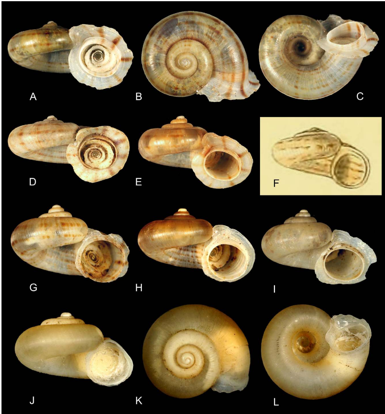
FIGURE 2. A–E. Leiabbottella thompsoni new species . A–C. Holotype (UF 456799), 13.7 mm width. D. Paratype (UF 236225), 14.1 mm width. E. Paratype (UF 236225), 13.6 mm width. F–I. Leiabbottella soluta (Pfeiffer, 1852). F. Illustration from Pfeiffer (1854: pl. 39, fig. 8). G. UF 216196, 11.9 mm width. H. UF 216196, 13.9 mm width. I. UF 216196, 13.8 mm width. J–L. Leiabbottella galaxius Watters, 2010. Paratype (OSUM 35491), 8.4 mm width.

Other material examined. UF 216194, 18 specimens, 5 km N of Majagual, Monte Plata Province, Dominican Republic; UF 236230, 29 specimens, 2 km N of Majagual, Monte Plata Province, Dominican Republic, at 150 m; UF 216189, 30 specimens, 7 km N of Majagual, Monte Plata Province, Dominican Republic, at 105 m; UF 216127, 26 specimens, 13 km NW of Sabana Grande de Boyá, Monte Plata Province, Dominican Republic, at 250 m; UF 249105, 6 specimens, N of Majagual, ca. 12 km NW of Sabana Grande de Boyá, Monte Plata Province, Dominican Republic, at 150 m; UF 216193, 22 specimens, 1 km N of Majagual, Monte Plata Province, Dominican Republic, at 200 m.