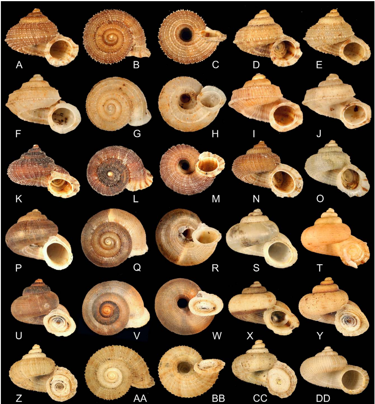
FIGURE 1. A–E. Abbottella (Abbottella) calliotropis new species . A–C. Holotype (UF 456810), 7.5 mm width. D. Paratype (UF 216131), 6.8 mm width. E. Paratype (UF 216131), 7.0 mm width. F–J. Abbottella (Abbottella) diadema new species . F–H. Holotype (UF 456814), 6.0 mm width. I. Paratype (UF 456815), 4.6 mm width. J. Paratype (UF 456815), 3.7 mm width. K–O. Abbottella (Abbottella) dichroa new species . K–M. Holotype (UF 456801), 9.9 mm width. N. Paratype (UF 216112), 8.8 mm width. O. Paratype (UF 216112), 9.4 mm width. P–T. Abbottella (Abbottella) nitens new species . P–R. Holotype (UF 456806), 7.8 mm width. Note pseudoscorpion web in umbilicus. S. Paratype (UF 456808), 8.3 mm width. T. Abbottella (Abbottella) mellosa Watters & Duffy, 2010. Holotype (UF 420729), 7.9 mm width. U–Y. Abbottella (Abbottella) tenebrosa new species . U–W. Holotype (UF 456796), 8.9 mm width. X. Paratype (OSUM 37271), 8.6 mm width. Y. Paratype (OSUM 37271), 8.3 mm width. Z–CC. Abbottella (Gundlachtudora) paradoxa new species . Z–BB. Holotype (UF 456812), 9.0 mm width. CC. Paratype (UF 456813), 8.9 mm width. DD. Abbottella (Gundlachtudora) bombardopolensis Bartsch, 1946. UF 33037, 7.0 mm width.