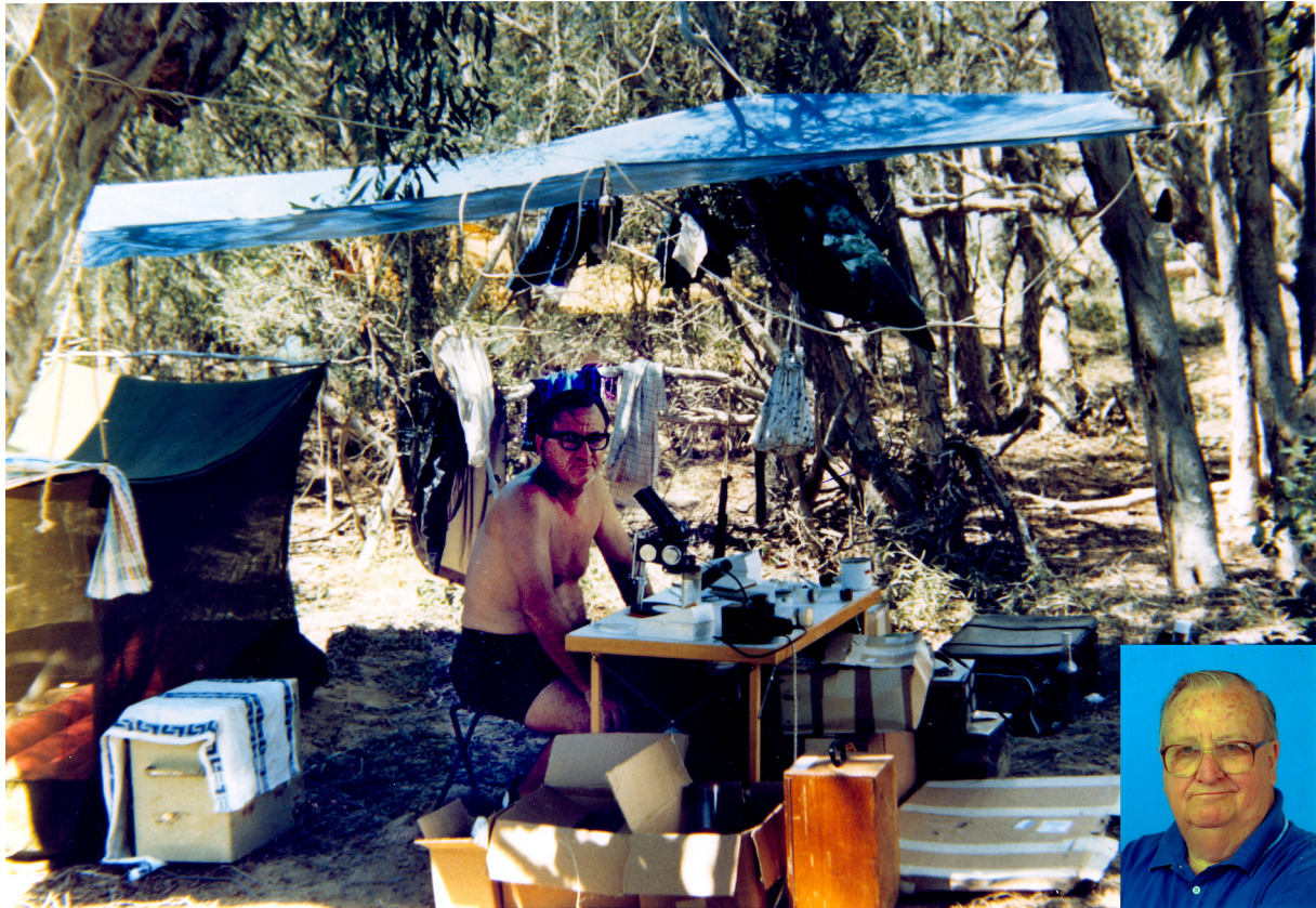
FIGURE 2. Pinning the night's catch, west Kimberley 1979; inset staff portrait taken in the 2000's.