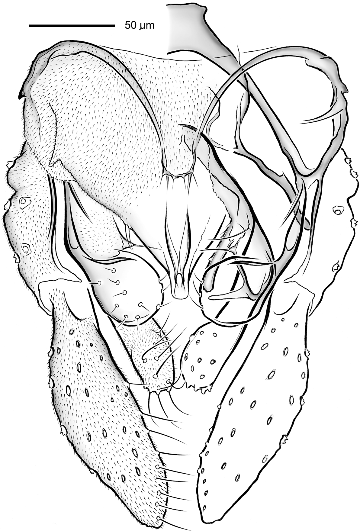
FIGURE 2. Micropsectra uva sp. nov., male. Hypopygium.