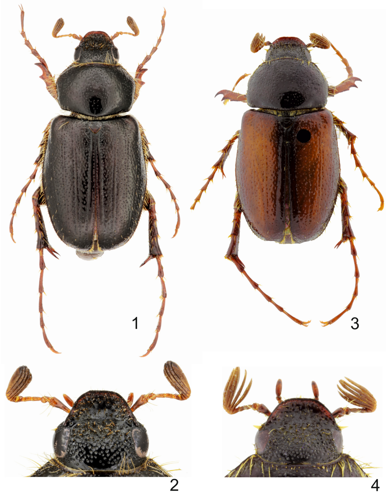
FIGURES 1–4. 1–2: Tanyproctus (Tanyproctus) arher Bezděk, Sehnal & Král, new species, holotype, 8.5 mm: 1. habitus; 2. head; 3–4: T. (T.) wraniki Král, Sehnal & Bezděk, 2012, holotype (Socotra, Diksam plateau, IBUR), 6.8 mm: 3. habitus; 4. head. Not in scale.