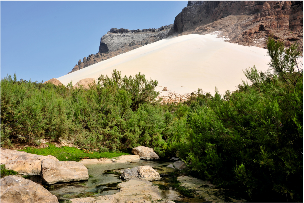
FIGURE 9. Type locality of Tanyproctus (Tanyproctus) arher Bezděk, Sehnal & Král, new species, Socotra, Haalla area, Arher, June 2012 (photograph by J. Hájek).

Male genitalia (Figs 5–6). Aedeagus symmetrical; parameres slender, relatively long, only slightly shorter than phallobase, distal part not dilated in dorsal aspect.