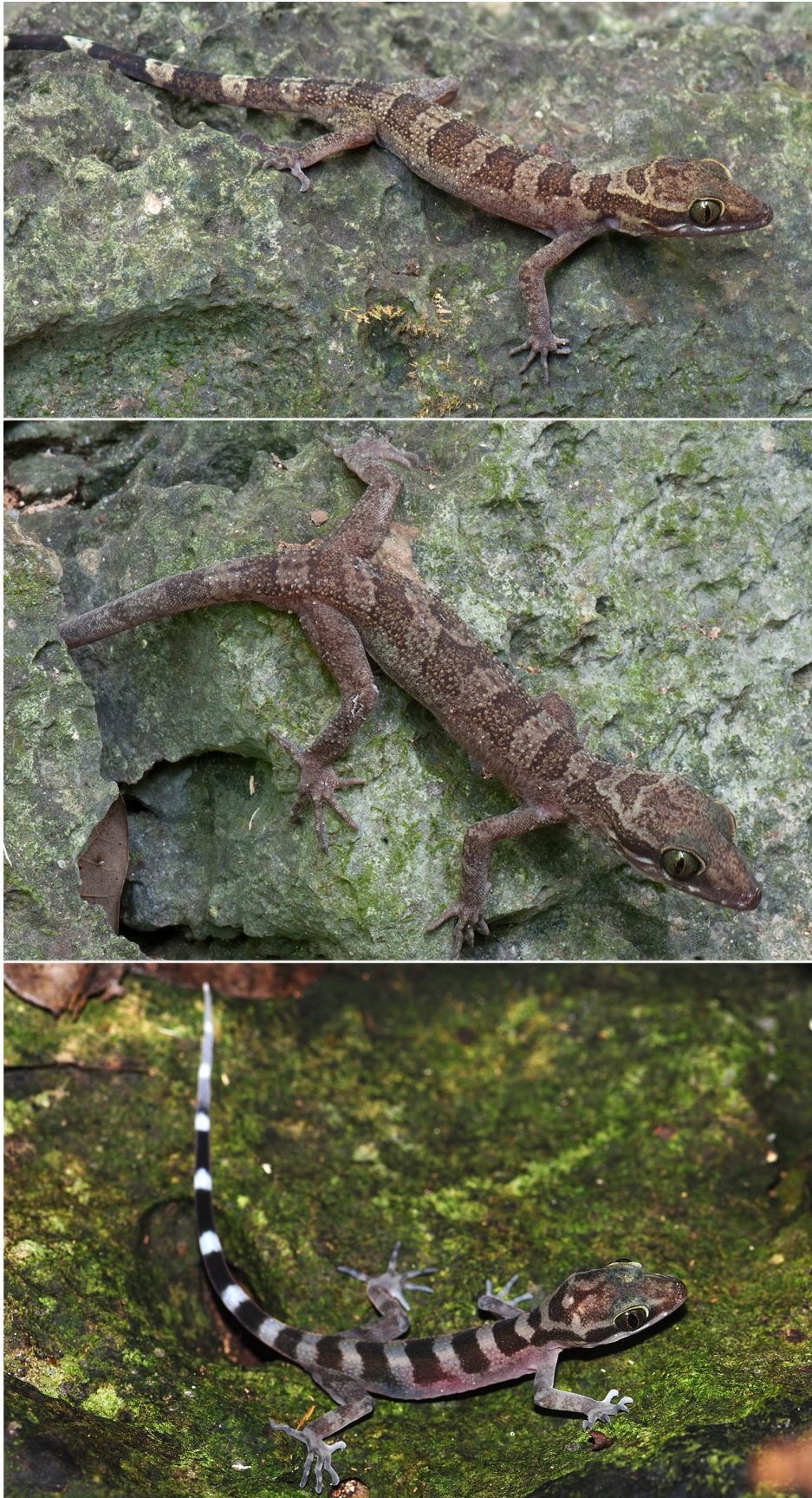
FIGURE 3. Upper: adult male holotype of Cyrtodactylus guakanthanensis sp. nov. (LSUHC 11322) from Gua Kanthan, Perak, Peninsular Malaysia. Middle: adult male paratype of C. guakanthanensis sp. nov. (LSUHC 11322). Lower: hatchling C. guakanthanensis sp. nov. (LSUDPC 8175)