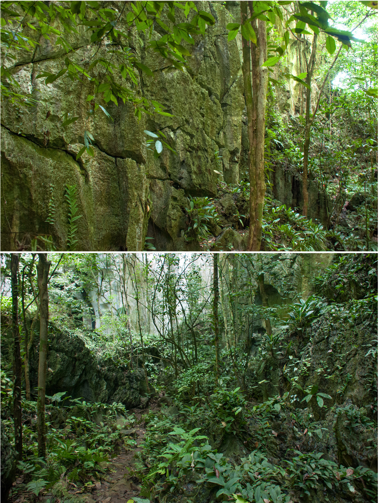
FIGURE 4. Habitat at the type locality, Gua Kanthan, Perak, Peninsular Malaysia. Upper: eroded and cracked limestone wall that provides refuge for Cyrtodactylus guakanthanensis sp. nov. Lower: structure of the limestone forest of the type locality.