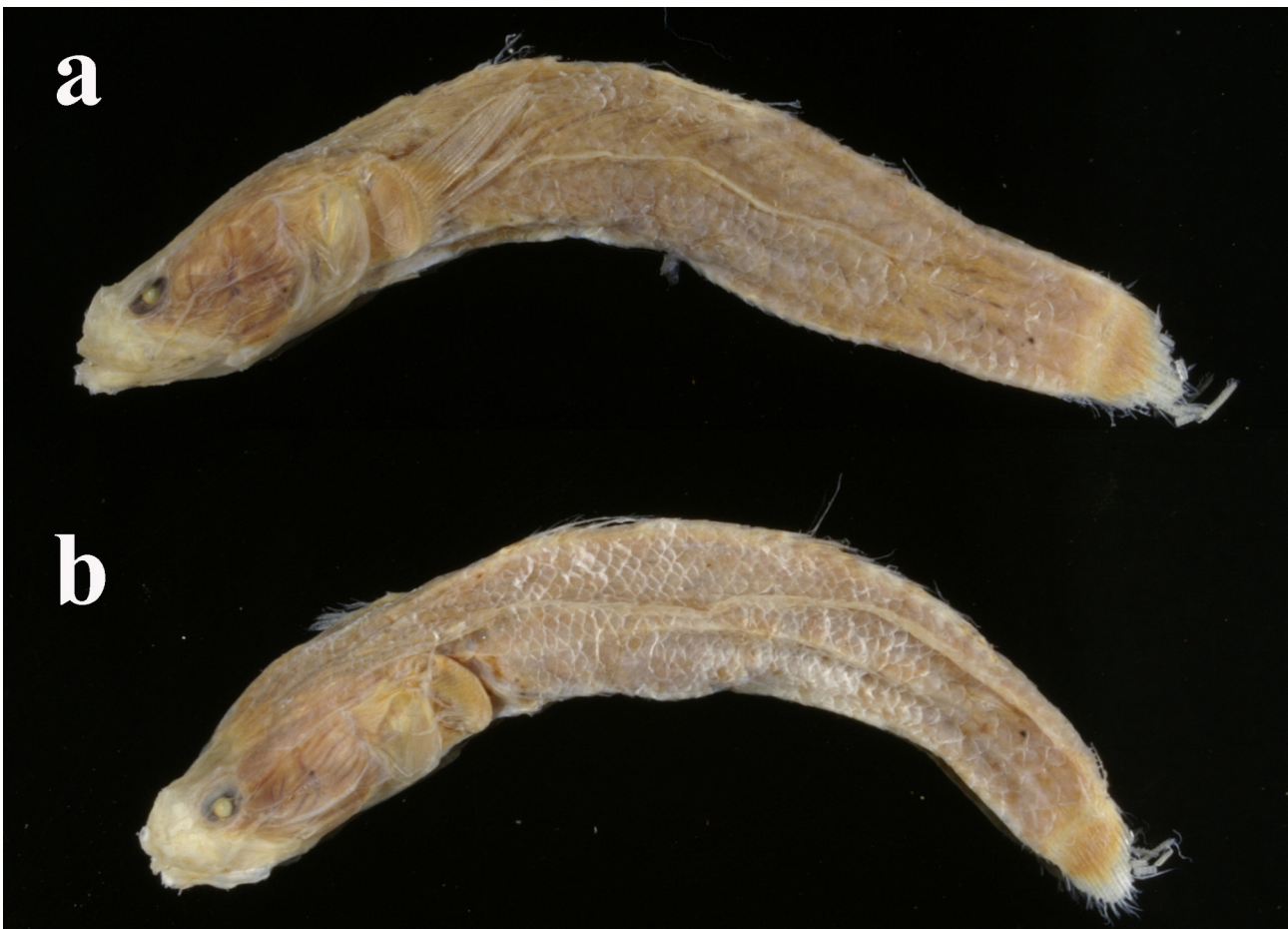
FIGURE 1. Type specimens of Gobiopsis liolepis (Bleeker): A) lectotype, RMNH.PISC.4411, 44.0 mm SL; B) paralectotype, RMNH.PISC.36383, 42.0 mm SL.

As a result of their poor condition, certain barbels were visible only on one specimen or even only on one side as indicated in Fig. 3. We found two pairs of chin barbels at the symphysis of the lower jaw of each specimen. A cheek tuft with at least one or more barbels was present at the anterior edge of the mid-cheek fold on either side of each specimen. The lectotype exhibited three posterior mandibular barbels on the skin covering the posterior portion of the dentary, and the paralectotype had three anterior gular barbels and at least two inter-mandibular barbels along the hyoid region and below the lower jaw. This distinctive arrangement is unique to Gobiopsis sensu