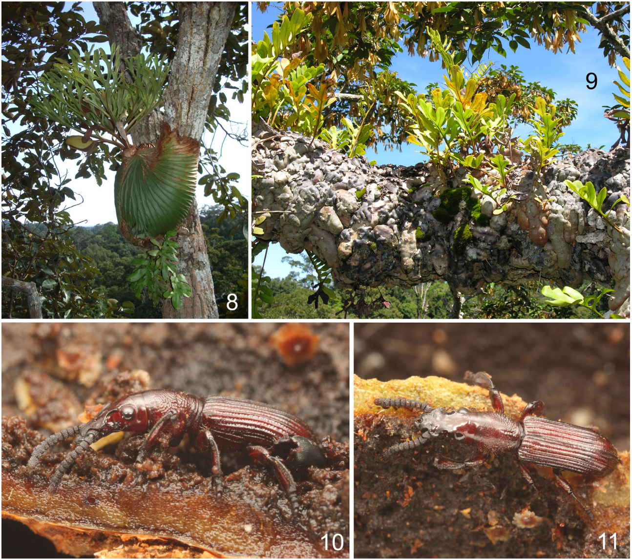
FIGURES 8–10. Habitat of Pycnotarsobrentus inuiiae gen. nov. and sp. nov. 8— Platycerium crustacea Copel., 9— Lecanopteris ridleyi H. Christ., 10, 11—living male in a domatia of Lecanopteris sp.

Description. Male. Body (Figs. 1, 2) dark brown, with legs slightly lighter.