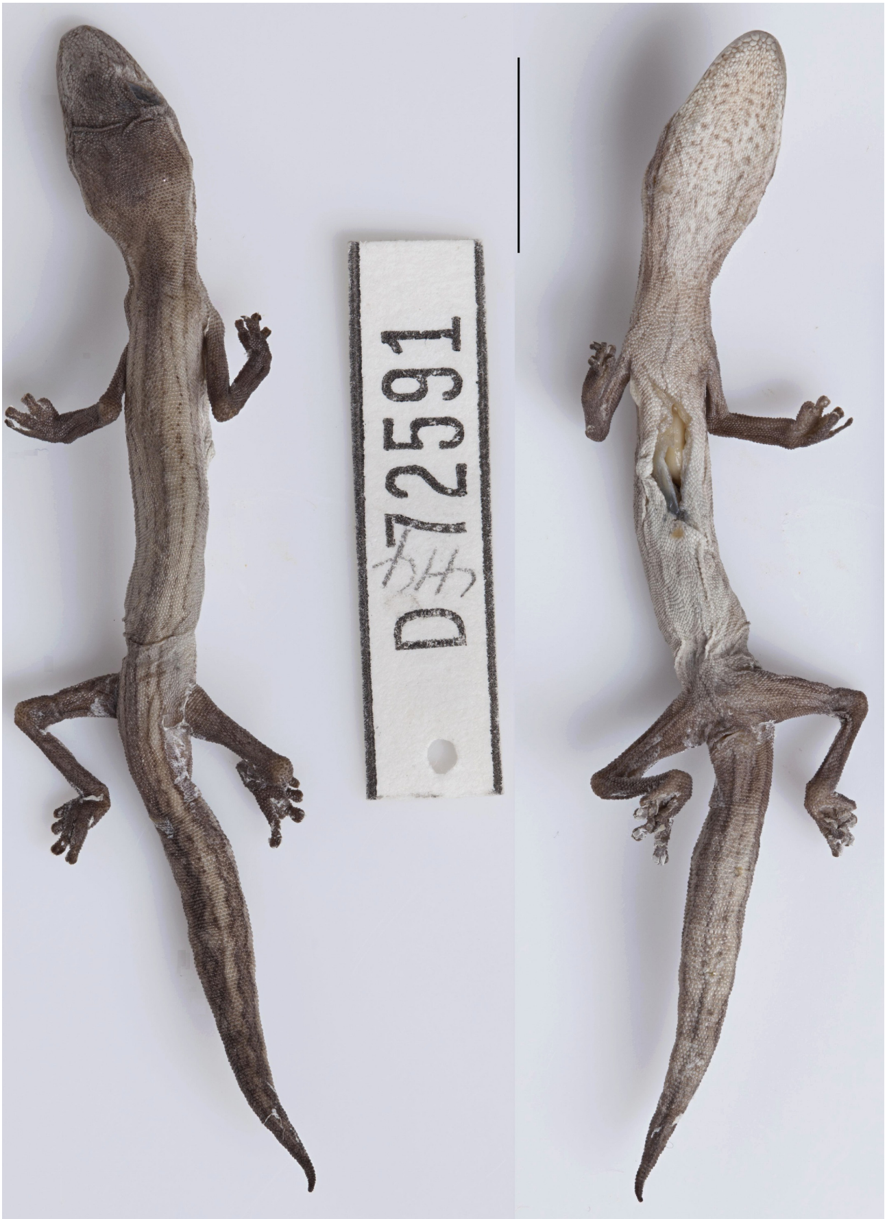
FIGURE 2. Dorsal and ventral view of holotype of Strophurus horneri sp. nov. NMV D72591. Scale bar =1cm.