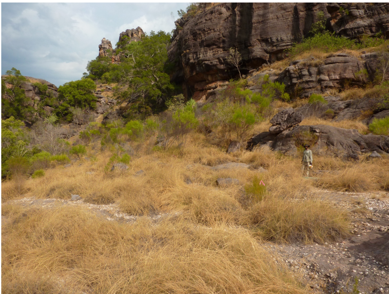
FIGURE 5. Habitat of Strophurus horneri sp. nov. at Namarragon Gorge, Kakadu National Park. The specimen in Fig. 4B was captured at night in a spinifex clump at this locality.

Of the six remaining species of Strophurus which lack caudal spines and are generally also found in association with spinifex or other grasses, Strophurus horneri sp. nov. can be distinguished from S. elderi , S. jeanae , and S. michaelseni (Werner 1910) by the presence of an internasal scale separating the rostral scale from the nostril (vs rostral in contact with the nostril); from S. mcmillani by its smaller size (adult SVL ~ 36.0 mm vs 40.3–49.1 mm) and less robust build (HW/SVL ~ 0.15 vs 0.17–0.19); and from S. robinsoni by its smaller adult size (SVL ~36.0 mm vs 53.0–56.0 mm), less robust build (HW/SVL ~ 0.15 vs 0.17–0.19), and dorsal pattern consisting of alternating yellow and grey stripes (vs very thin discontinuous dark grey longitudinal striations on a light grey background).