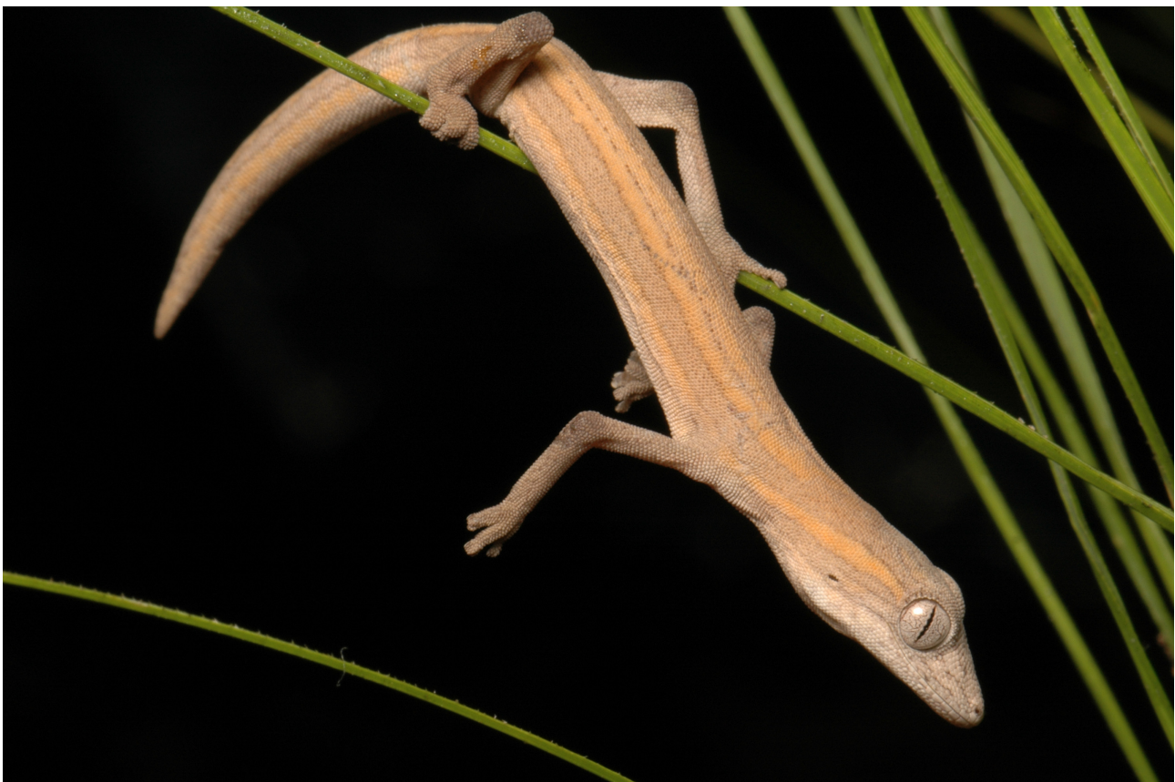
FIGURE 3. Strophurus horneri sp. nov. in life. Holotype NMVD72591 photographed at Yirrkakak.

Colouration in life. A photograph of the holotype in life (Fig. 3) shows the areas of the dorsum and tail that are very light in preservative have a very clear yellowish wash and form four distinct longitudinal stripes that