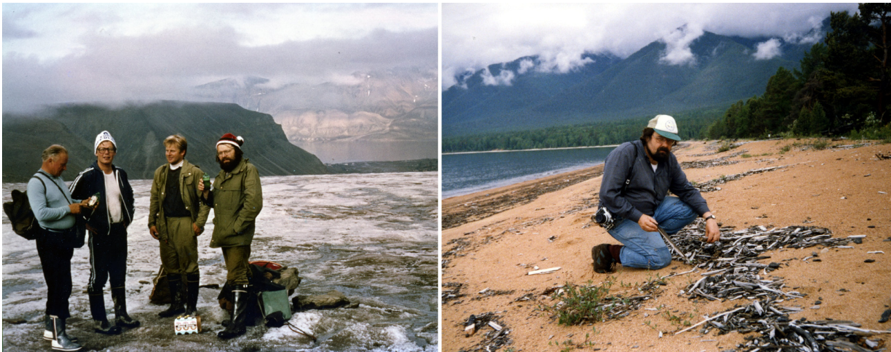
PHOTO 3. Longyearbyen, Spitsbergen - July 1980 (left) and Baikal Lake shore - 1996 (right).

Congress of Arachnology (Turku, 1989, a Secretary and the Editor of the Congress Proceedings), 21 th European Colloquium (=Congress) of Arachnology (St.-Petersburg, 2003), and Nordic-Baltic Entomological Congresses in Turku (1994), Tartu, Estonia (1994) and Birstonas, Lithuania (2010).