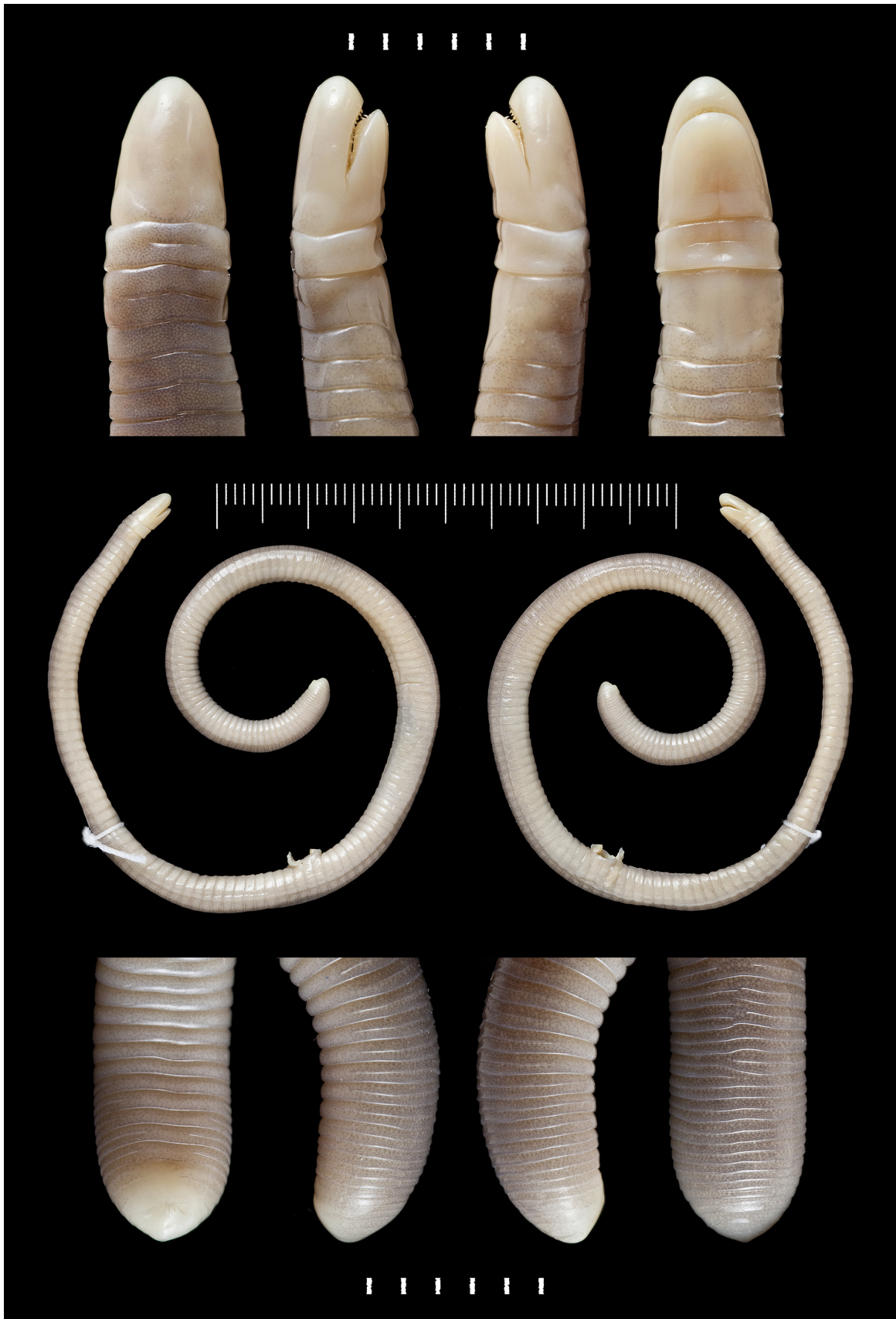
FIGURE 1. MZUSP 143389, holotype of Microcaecilia butantan sp. nov. Scale bars in mm.

other by about twice width of single choana, anterior margins approximately level with TAs. Tongue somewhat pointed at tip, attached anteriorly, smooth except for a medial longitudinal groove posteriorly.