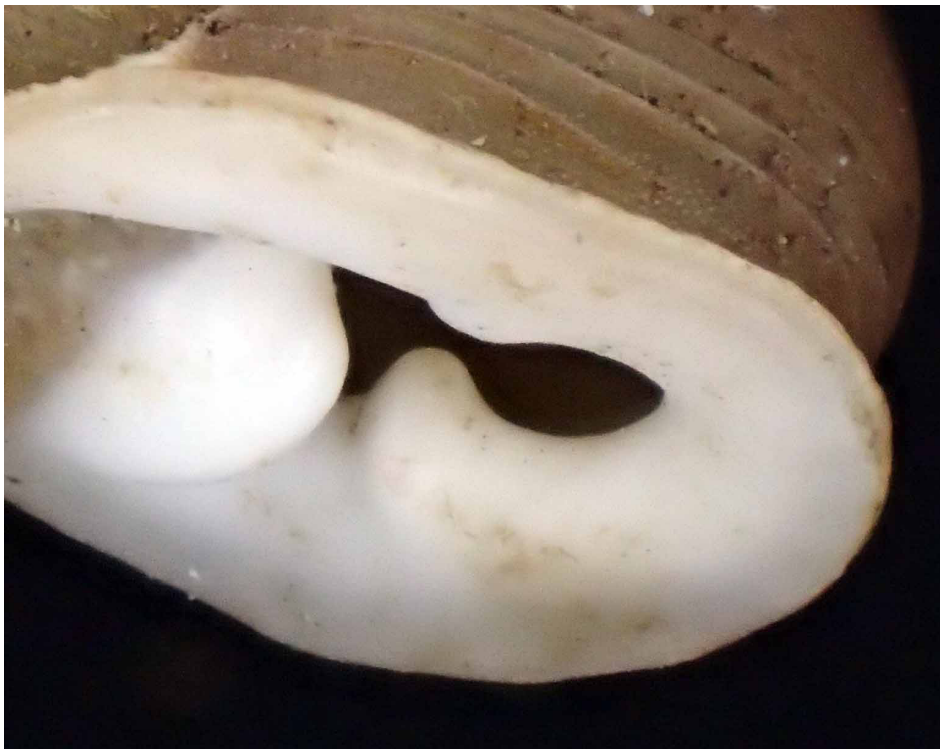
FIGURE 2. View of the aperture and basal denticle of Triodopsis j. robiniae subsp. nov. holotype (CM103371).