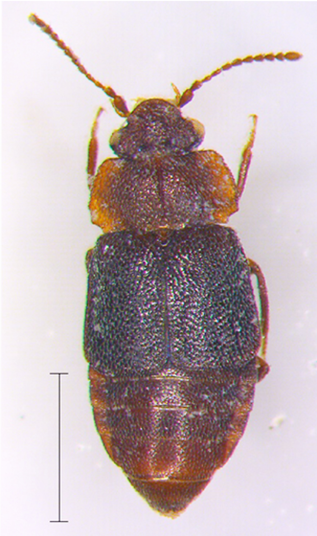
FIGURE 1. Megarthus alatorreorum sp nov. Habitus (scale bar = 1 mm).