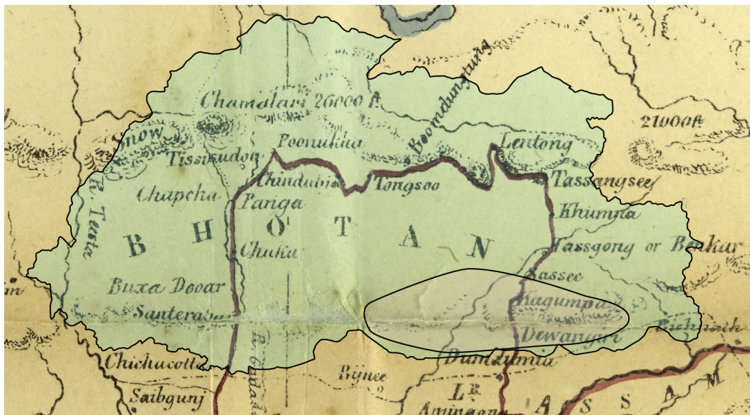
FIGURE 2. Map of Griffith's expedition (base map from Griffith and McClelland 1848) through Bhutan, and a generalized range map of Aborichthys boutanensis in southern Bhutan (lighter oval) based on observations of first author (RJT). Bhutan's modern border is superimposed (green area). The brown line is the path taken by Griffith.

and Rotung, Aunachal Pradesh; Dihang River, near Yembung; Sirpo River near Renging, Abor Hills, India Adiposia boutanensis (McClelland).—Hora 1928: 483. Locality: Helmand basin probably in the neighborhood of the Bolan Pass Paracobitis boutanensis (McClelland).— Bănărescu & Nalbant 1995:443; Kottelat 2012: 99. Locality: Bolas Pass, Helmand drainage [based erroneously on Hora (1928)]