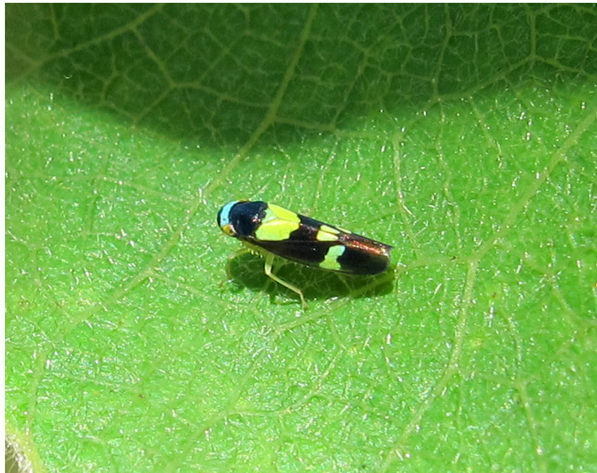
FIGURE 19. Live specimen of Segonalia machadoi sp. nov. at type locality (Parque Nacional de Sete Cidades, Piracuruca, Piauí State, Brazil).

Furthermore, Young (1977) states that the characteristic unpaired paraphysis of Segonalia does not lie medially and is asymmetrical. Because the paraphysis connects to the aedeagus through a membrane, the position in relation to the aedeagus can vary and it may lie medially or laterally to the aedeagus (as originally illustrated). Nevertheless, its basal portion and ramus are structurally symmetrical. Therefore, specimens of Segonalia in Young’s (1977) key to genera of New World Cicadellini will not key out correctly given the Segonalia exit in couplet 87: “Paraphyses with a simple ramus that is not median”.