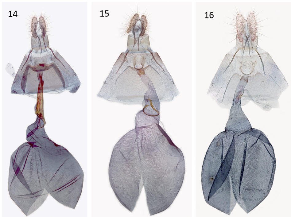
FIGURES 14–16. Female genitalia of Loboschiza spp. 14. L. koenigiana . 15. L. spiniforma , n.sp. (paratype). 16. L. bisulca , n.sp. (paratype).