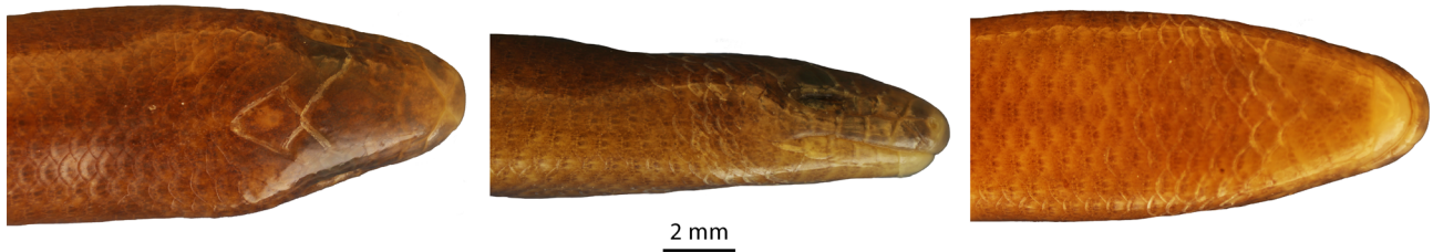
FIGURE 3. Photograph of dorsal, lateral, and ventral views of head of the preserved holotype of Brachymeles ilocandia sp. nov. (PNM 9819).

Brachymeles ilocandia sp. nov. can be distinguished from congeners by the following combination of characters: (1) body size small (SVL 65.7–77.6 mm), (2) limbs digitless, (3) limb length short, (4) supralabials six, (5) infralabials five or six, (6) supraciliaries five, (7) supraoculars four, (8) midbody scale rows 22–24, (9) axilla–groin scale rows 80–82, (10) paravertebral scale rows 97–100, (11) mental/first infralabial fusion present or absent, (12) prefrontal contact absent or in point contact, (13) frontoparietal contact present, (14) enlarged chin shields in three pairs, (15) nuchals enlarged, (16) auricular opening absent, (17) presacral vertebrae 50–53, and (18) uniform body color (Tables 1, 2).