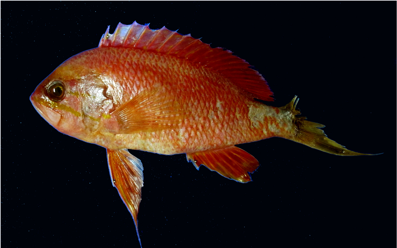
FIGURE 2. Odontanthias cauoh sp. n., MZUSP 111260, holotype, 165.2 mm SL from São Pedro and São Paulo Archipelago, Brazil.

Diagnosis. The new species differs from its only Atlantic congener by a combination of several characters: pectoral-fin rays 20; total gill rakers on first arch 39; vomerine tooth patch with a posterior prolongation; pelvic fin not reaching base of last anal-fin ray; dorsal, anal, and pelvic fins scaleless; and coloration (dorsal, anal, and pelvic fins mostly dark red).