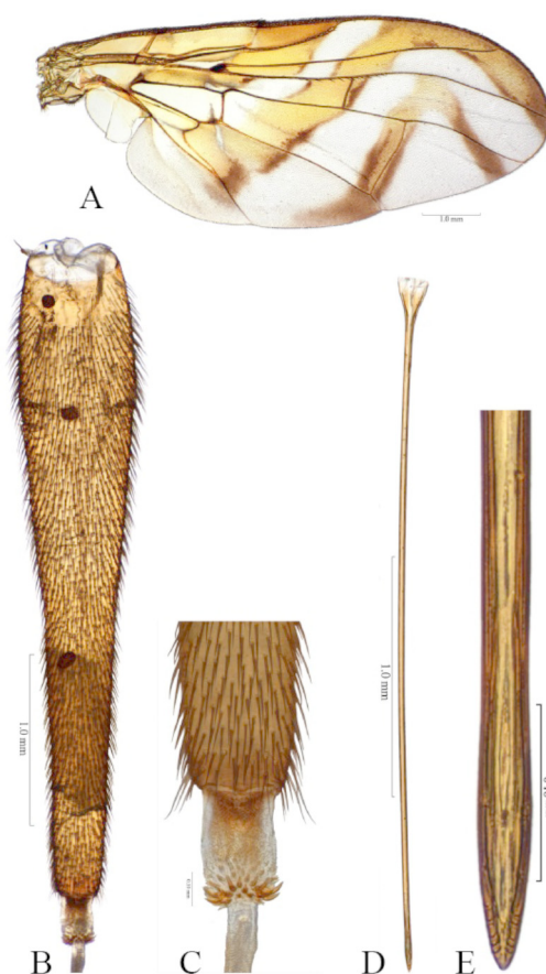
FIGURE 2. Anastrepha luederwaldti (Brazil: Nova Teutonia). A, wing; B, oviscape; C, eversible membrane, dorsal; D, aculeus; E, aculeus tip, ventral.

Thorax. Integument mostly yellow to orange. Scutum on posterior margin with pair of small, faint to moderate brown spots or markings anterior to corner of scutellum (on dorsocentral line or between it and intra-alar line). Scuto-scutellar suture without distinct band or medial spot, but sometimes slightly darker orange brown medially. Postpronotal seta on posterior half of postpronotal lobe. Mesopleuron mostly yellow to orange, without brown markings. Normal pale markings poorly differentiated in examined specimens; postpronotal lobe, dorsal margin of anepisternum, postsutural sublateral scutal vitta, and scutellum clearly white to pale yellow in some specimens. Subscutellum and mediotergite entirely yellow to orange. Mesonotum 3.40–4.01 mm long; 2.2–2.5 mm wide. Postpronotal lobe, scutum and scutellum entirely microtrichose. Scutal setulae yellowish. Chaetotaxy typical for genus. Acrostichal, dorsocentral and intra-alar setae well developed. Katepisternal seta well developed, three-fifths as large as anepisternal seta and as large and stout as anepimeral seta, and same in color. Legs entirely yellow to orange. Fore femur with posterodorsal and ventral rows of well developed setae.