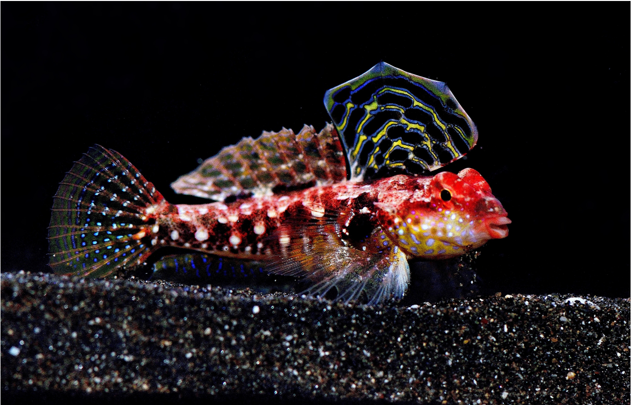
FIGURE 6. Synchiropus tudorjonesi , male aquarium specimen, collected from Bali, Indonesia. Specimen not retained; approximately 50 mm SL (Y.K. Tea).