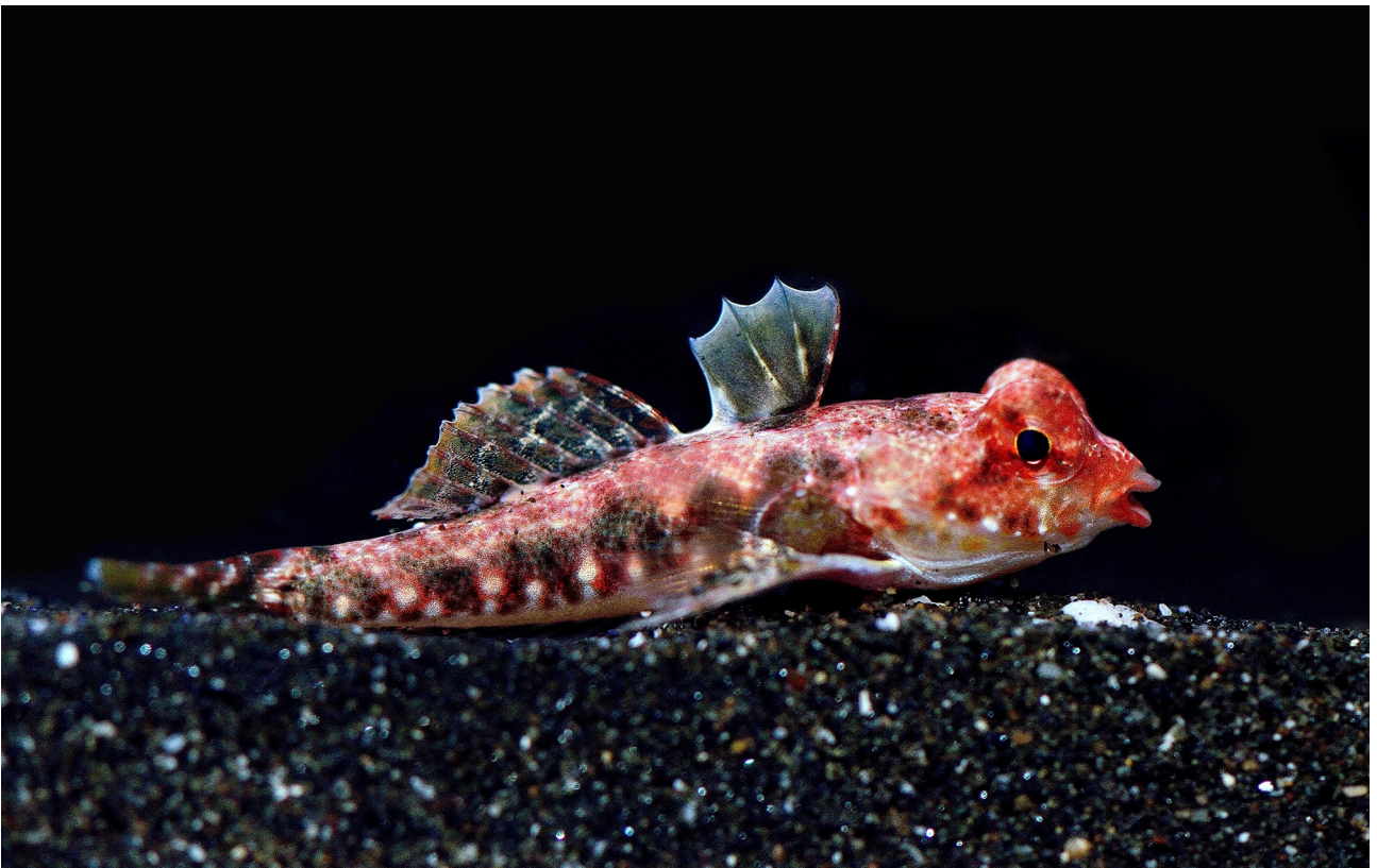
FIGURE 7. Synchiropus tudorjonesi , female aquarium specimen, collected from Bali, Indonesia. Specimen not retained; approximately 35 mm SL (Y.K. Tea).