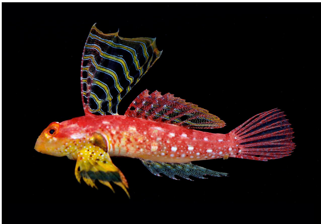
FIGURE 1. Synchiropus sycorax, new species, male holotype when freshly dead, AMS I.47200-001, 39.4 mm SL, Jolo Island, Sulu Archipelago, Philippines.

Colour in alcohol. Similar to live coloration; dark grey to black markings and white markings remain; red markings become pale reddish brown; yellow markings become pale tan.