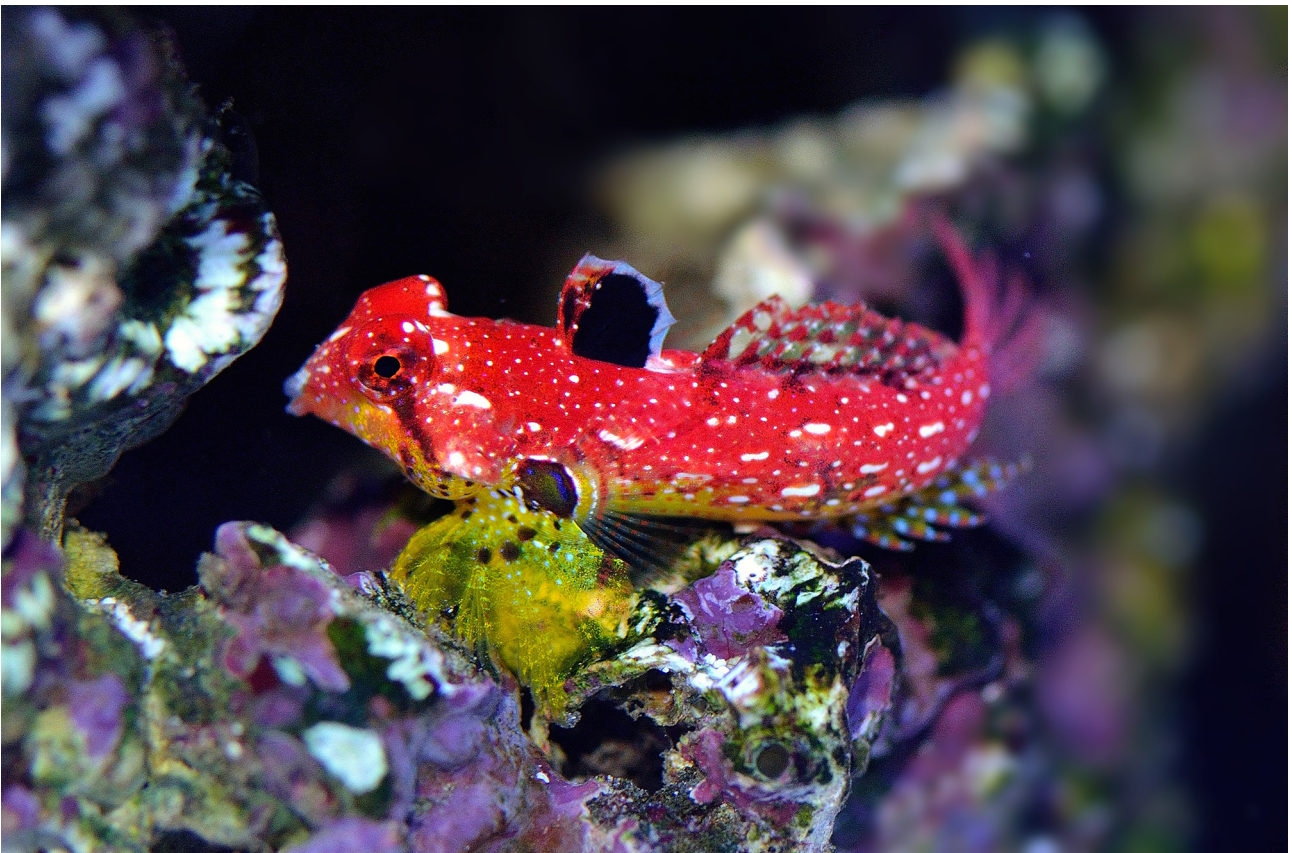
FIGURE 3. Synchiropus sycorax , female, aquarium specimen from Jolo Island, Philippines. Specimen not retained; approximately 20 mm SL (Y.K. Tea).