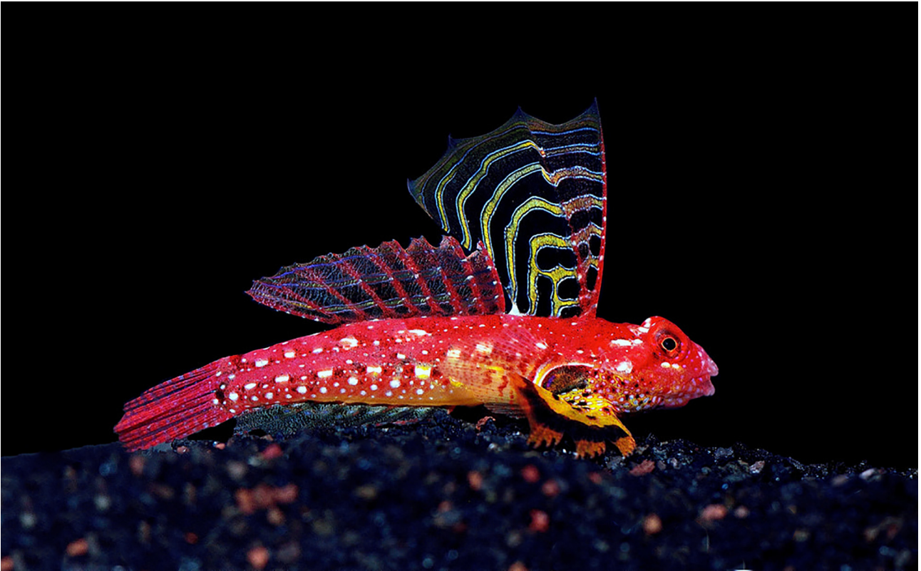
FIGURE 2. Synchiropus sycorax , male paratype in an aquarium, ZRC 54776, 40.1 mm SL, Jolo Island, Sulu Archipelago, Philippines.