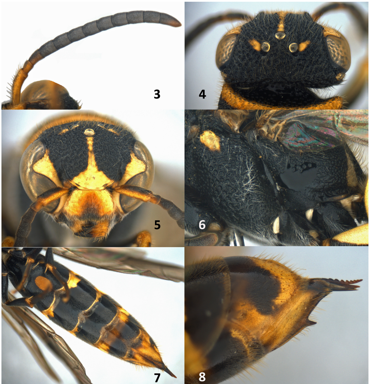
FIGURES 3–8. Polochridium spinosum sp. nov., holotype, ♀. 3. Antenna; 4. Head, dorsal view; 5. Head, frontal view; 6. Mesopleuron, metapleuron and propodeum, lateral view; 7. Metasoma, ventral view; 8. Apex of metasoma, lateral view.

Description. FEMALE (holotype). Body length 10.6 mm. Fore wing length 7.2 mm. Head. Penultimate flagellomere width 1.15 \times apical flagellomere width (Fig. 3). Malar space much shorter than apical width of scape (5:12). Frons and temple densely and coarsely punctate (Figs 1, 5). Vertex coarsely punctate, with distinct smooth interspaces; smooth interspaces between punctures about equal diameter of punctures (Fig. 4). Malar space moderately punctate. Clypeus sparsely punctate (Fig. 5).