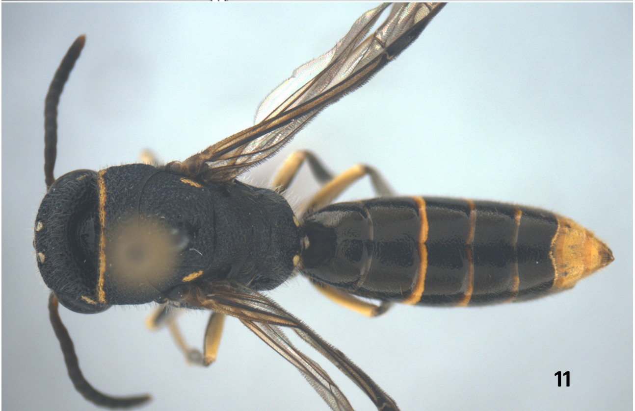
FIGURES 10, 11. Polochridium spinosum sp. nov., paratype, ♂, habitus. 10. Lateral view; 11. Dorsal view.