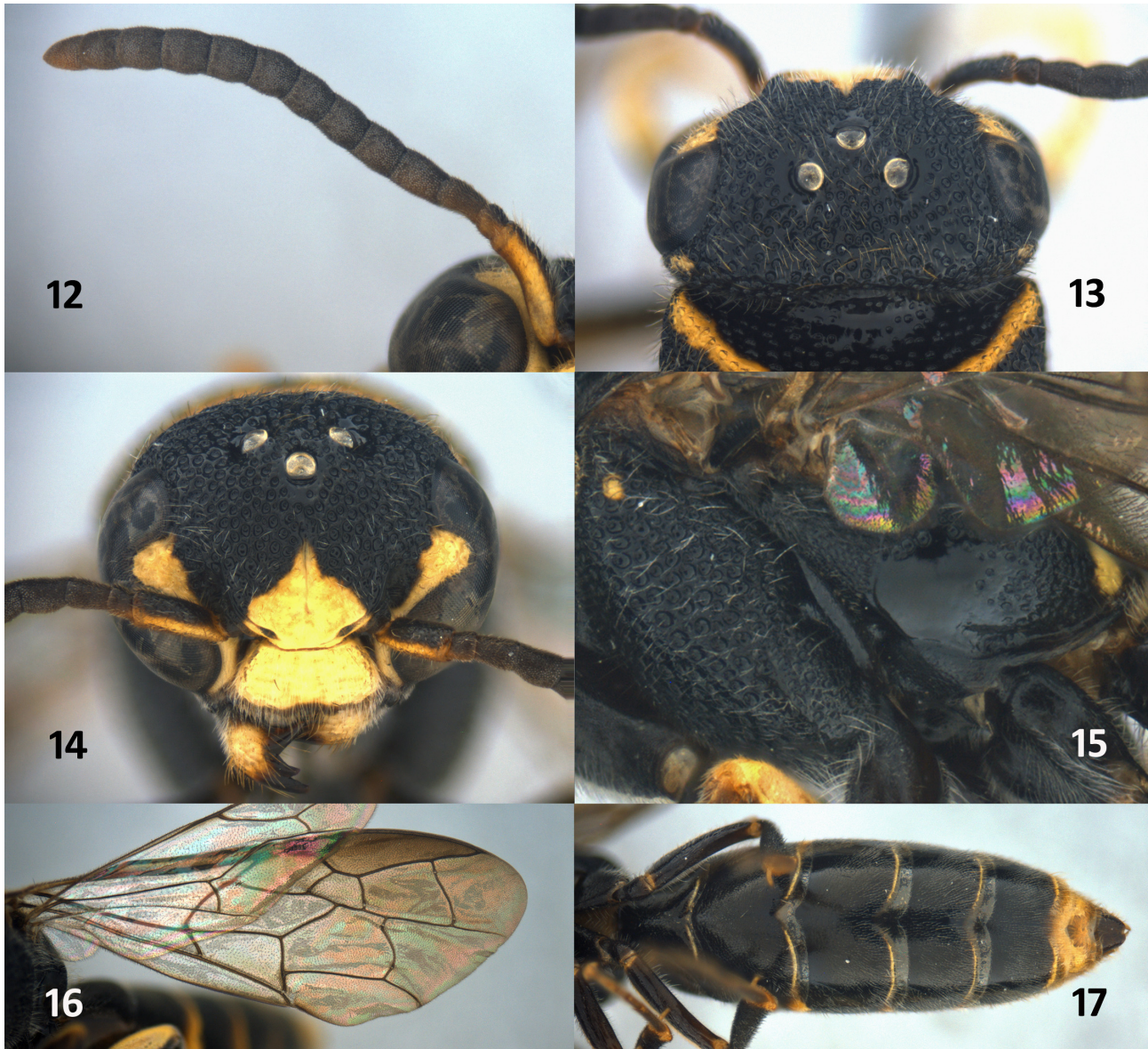
FIGURES 12–17. Polochridium spinosum sp. nov., paratype, ♂. 12. Antenna; 13. Head, dorsal view; 14. Head, frontal view; 15. Mesopleuron, metapleuron and propodeum, lateral view; 16. Wings; 17. Metasoma, ventral view.

Mesosoma. Pronotum coarsely punctate, with narrow smooth interspaces medio-dorsally; smooth interspaces about half diameter of punctures (Fig. 11). Mesoscutum and mesoscutellum densely and coarsely punctate (Fig. 11). Mesopleuron densely and coarsely punctate (Figs 10, 15). Metapleuron densely and moderately punctate anteriorly, and rugose posteriorly with smooth shiny area above it (Figs 10, 15). Metanotum densely and moderately coarsely punctate (Fig. 11). Propodeum densely and moderately coarsely punctate dorsally, laterad with large shiny area (Figs 11, 15).