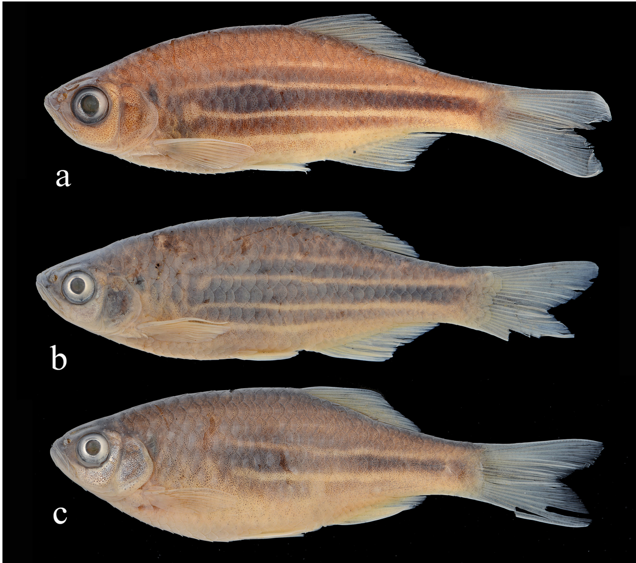
FIGURE 1. Devario fangae . (a) holotype, NRM 45659, male, 47.9 mm SL; (b) paratype, NRM 40919, male 58.5 mm SL; c) paratype, NRM 69442, female, 49.2 mm SL. All from Kachin State, Putao, Ayeyarwaddy River drainage, Nan Hto Chaung.

Vertebrae 16+15=31 (1), 16+16= 32 (2), 16+17=33 (1), 16+18=34* (1), 17+16=33 (6), 17+17=34 (9). Pharyngeal teeth 2,3,5/5,3,2 (NRM 40918, 48.8 mm SL).