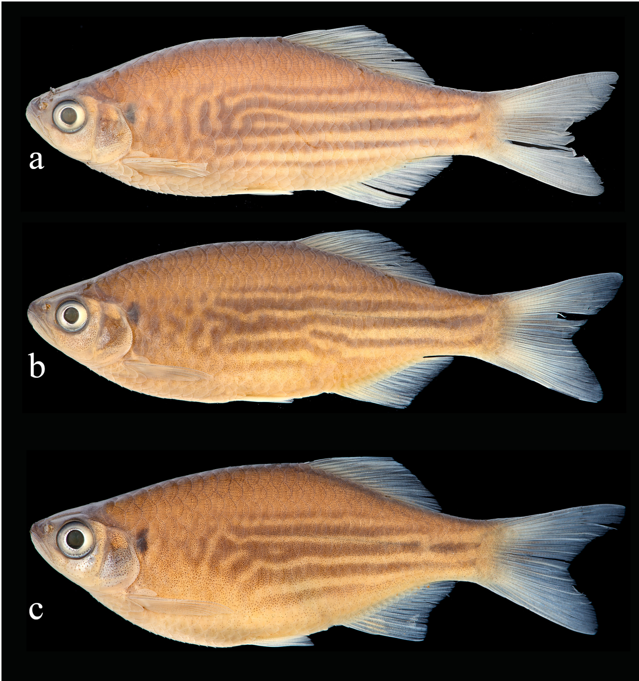
FIGURE 5. Devario myitkyinae . (a) holotype, NRM 69501, male, 65.8 mm SL; (b) paratype, NRM 36363, male, 61.8 mm SL; (c) paratype, NRM 36364, female, 56.7 mm SL. All from Myanmar: Kachin State, Ayeyarwaddy River drainage, Hpa Lap Chaung near Myitkyina.

Lateral line complete, along 30 (3), 31* (5), 32 (8), 33 (3) scales, and two scales on caudal-fin base; comprising one tubed scale followed by a canal running steeply caudoventrad under about five unperforated scales to slightly posterior to pectoral-fin base, where curved caudad and represented by perforated scales running in a curve parallel to the ventral body outline and ending low on caudal peduncle and caudal-fin base; continued by two scales on caudal-fin base. Median predorsal scales 13 (1), 14* (15), 15 (3). Lateral scale rows passing between dorsal and pelvic fins \frac{1}{2}7+1+2\frac{1}{2}^* (19). Circumpeduncular scale rows 12* (19). A row of scales along anal-fin base. About \frac{1}{4} of caudal-fin length scaled basally.