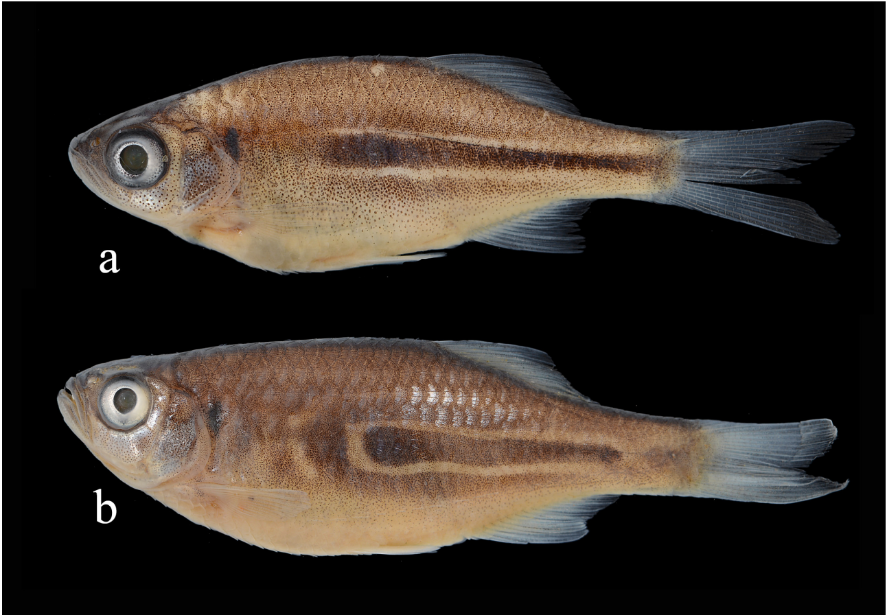
FIGURE 2. Devario fangae . (a) paratype NRM 69440, 30.0 mm SL; (b) paratype, NRM 69442, 43.4 mm SL. Both from Kachin State, Putao, Ayeyarwaddy River drainage, Nan Hto Chaung.

Dorsal and anal fins lightly pigmented, without markings; caudal fin basally lightly pigmented along middle rays, most of fin hyaline. Pectoral and pelvic fins hyaline.