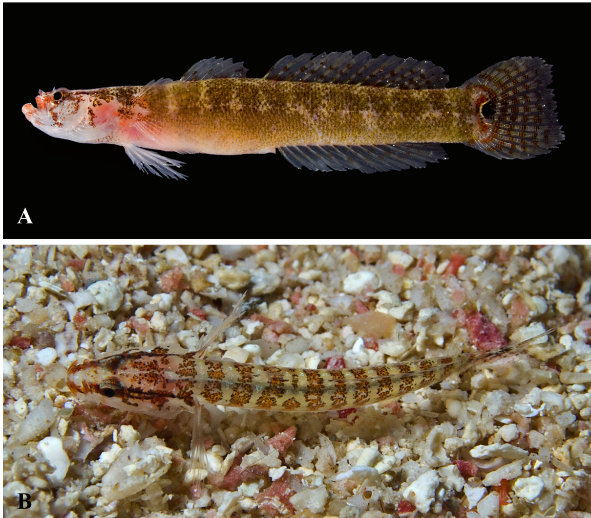
FIGURE 5. Xenisthmus polyzonatus , A: uncatalogued, 36.0 mm SL, Mangrove Bay, El Quseir, Egypt, Red Sea; B: SMF 35838, 14.8 mm SL juvenile, Dubai, Saudi Arabia, Red Sea.

throughout this range has not been completed (currently underway by the first author), and it is possible that there is a complex of closely related species involved. Preliminary molecular analyses also showed that specimens from the western Pacific identified as X. polyzonatus represent distinct lineages. We therefore restrict our treatment of the species to specimens from the Red Sea, where it is widely distributed (Figure 3). It typically inhabits crevices close to the base of fringing reefs in the depth range of 1.5–16 m.