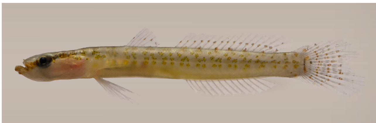
FIGURE 1. Xenisthmus oligoporus , new species, holotype, SMF 34908, 18.0 mm SL male, Duba, Saudi Arabia, Red Sea.

Diagnosis. Xenisthmus oligoporus is distinguished from congeners in having a reduced number of cephalic sensory pores (lacking pores A, I, J, K, P and Q) and in having 14–15 segmented rays in the second dorsal fin.