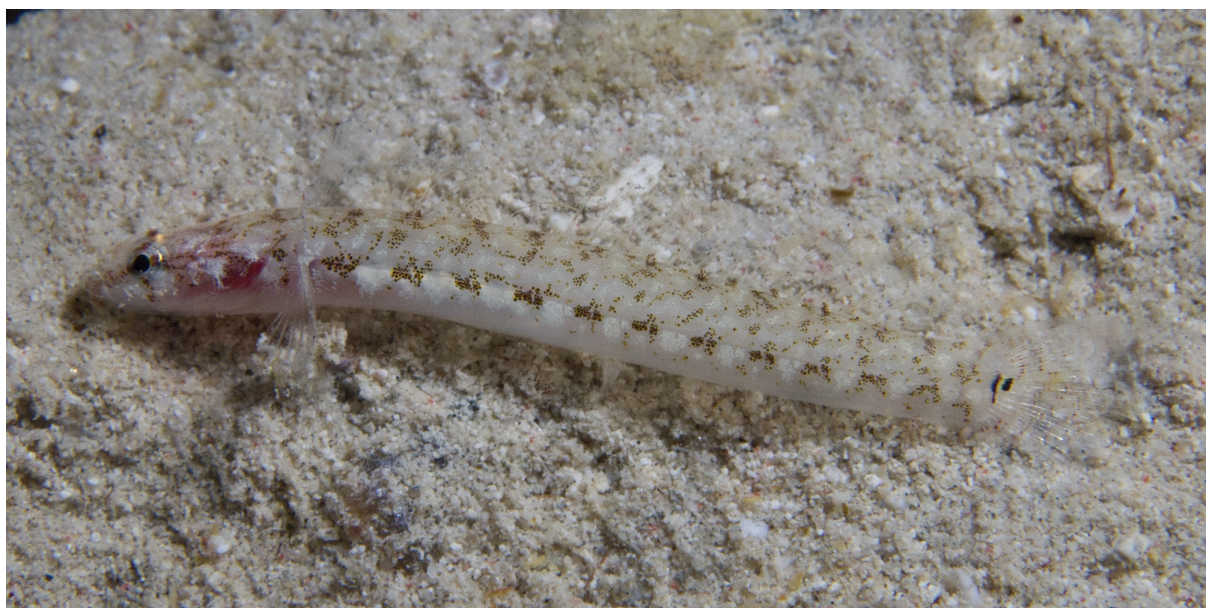
FIGURE 4. Xenisthmus balius , SMF 35837, 22.0 mm SL female, Al Lith, Saudi Arabia.

Upper jaw with two or three (anteriorly) or two (posteriorly) rows of small, conical teeth, the outer-row teeth largest and slightly curved; lower jaw with three (anteriorly) or two (posteriorly) rows of small, conical teeth, the outer-row teeth largest and slightly curved; vomer, palatines and tongue edentate.