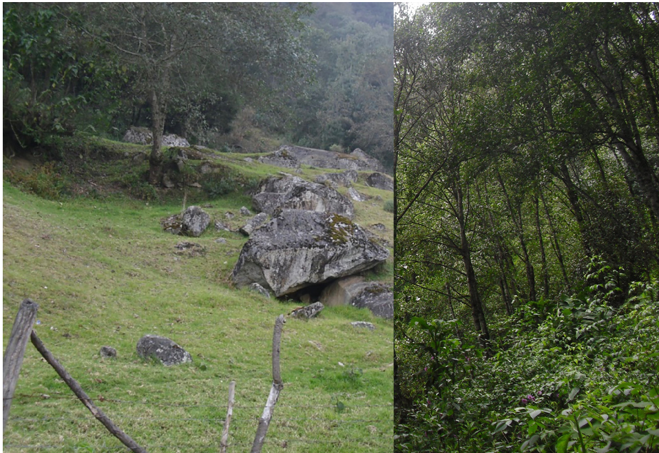
FIGURE 3. Disturbed Alnus acuminata forest habitat for Mesaspis antauges in the Municipio de Alpatláhuac, Pico de Orizaba, Veracruz.

We captured all of our new material while the lizards were basking in the morning, always in open areas near forest edges and close to microhabitat refuges (tall grass, bare roots, rotting logs, rocks, bushes). The lizards were terrestrial in habit. We encountered the adult male (MZFC-HE 29310) in a church courtyard, the adult female (MZFC-HE 29311) moving over leaf litter in a fragmented patch of Alnus acuminata (Fig. 3), and the subadult (MZFC-HE 29312) hiding among the roots of a shrub within an orchard of Prunus domestica . Natural vegetation in the surrounding areas is composed mainly of Alnus acuminata forest, although tracts dominated by Quercus spp. and Pinus spp. are also present. Undisturbed forest in the region is now largely restricted to the ridgelines and steep upper slopes of the generally east-west trending valleys. The zones where we encountered the specimens retain only fragments of forest, embedded in a matrix of pastures, cropland, orchards, and rural residences.