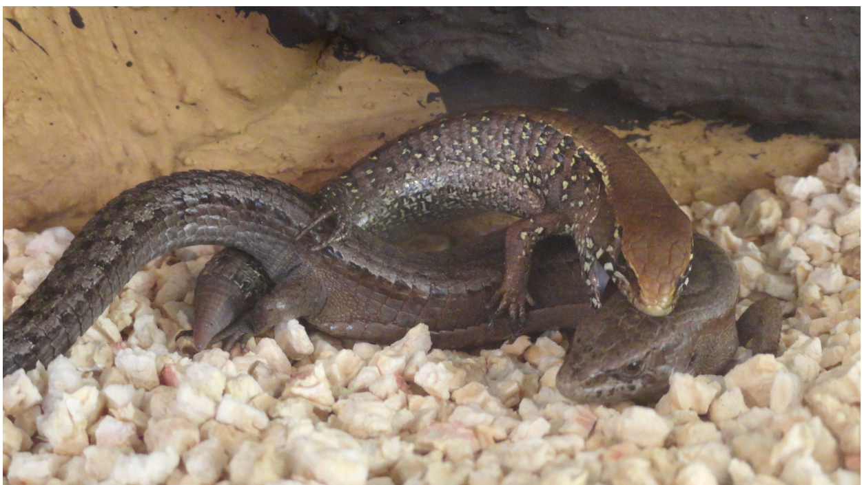
FIGURE 4. Copulating Mesaspis antauges in captivity. Male MZFC-HE 29310 (top), and female MZFC-HE 29311 (bottom).