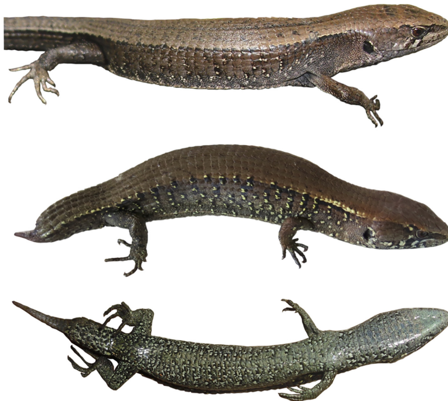
FIGURE 2. Habitus of Mesaspis antauges in life. Top photo: subadult MZFC-HE 29312. Middle and bottom photos: adult male MZFC-HE 29310.