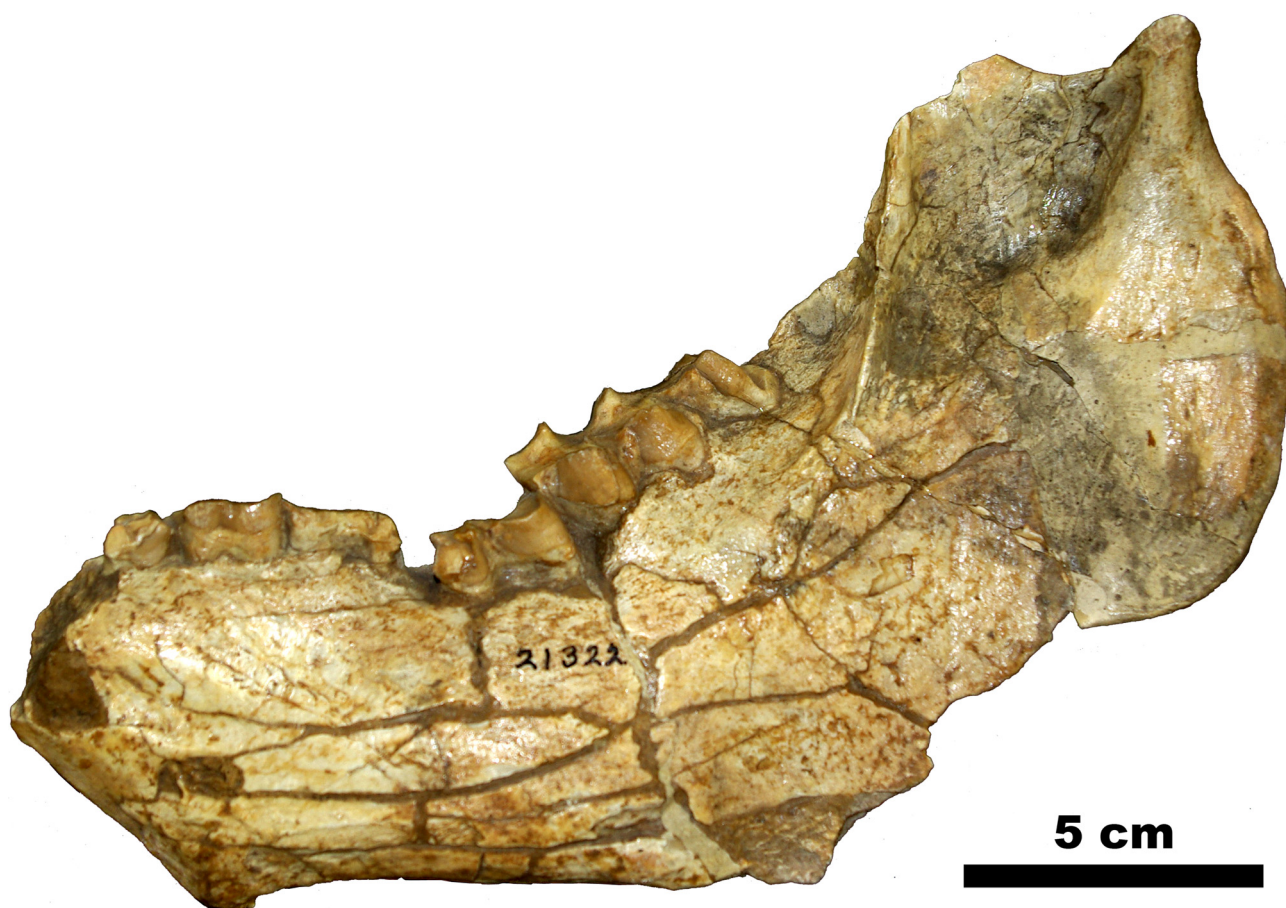
FIGURE 2. AMNH 21322, paralectotype jaw of Brachycrus laticeps mooki , lateral view.