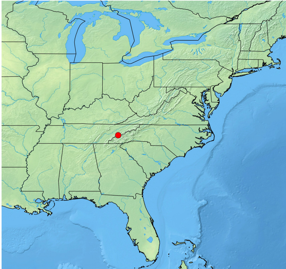
FIGURE 1. Erasmoneura tricuspidata sp.n. Distribution map.