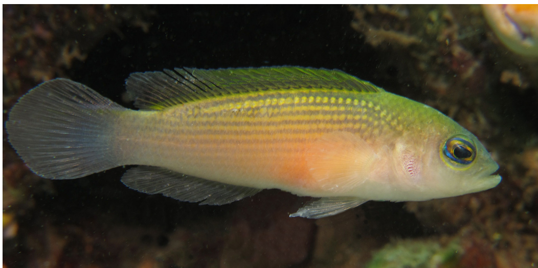
FIGURE 1. Pseudochromis stellatus , MZB 23884, 46.5 mm SL, holotype, Dayan Channel, Batanta, Raja Ampat Islands, Indonesia.

Paratypes. WAM P.33705-002, 1: 44.9 mm SL, collected with holotype; AMS I.47330-001, 1: 36.5 mm SL, Indonesia, West Papua Province, Raja Ampat Islands, Batu Hitam (0°4'57"S 130°4'59"E), 62 m, M.V. Erdmann, 5 December 2011; WAM P.33630-001, 3: 25.5–47.0 mm SL, collected with AMS I.47330-001.