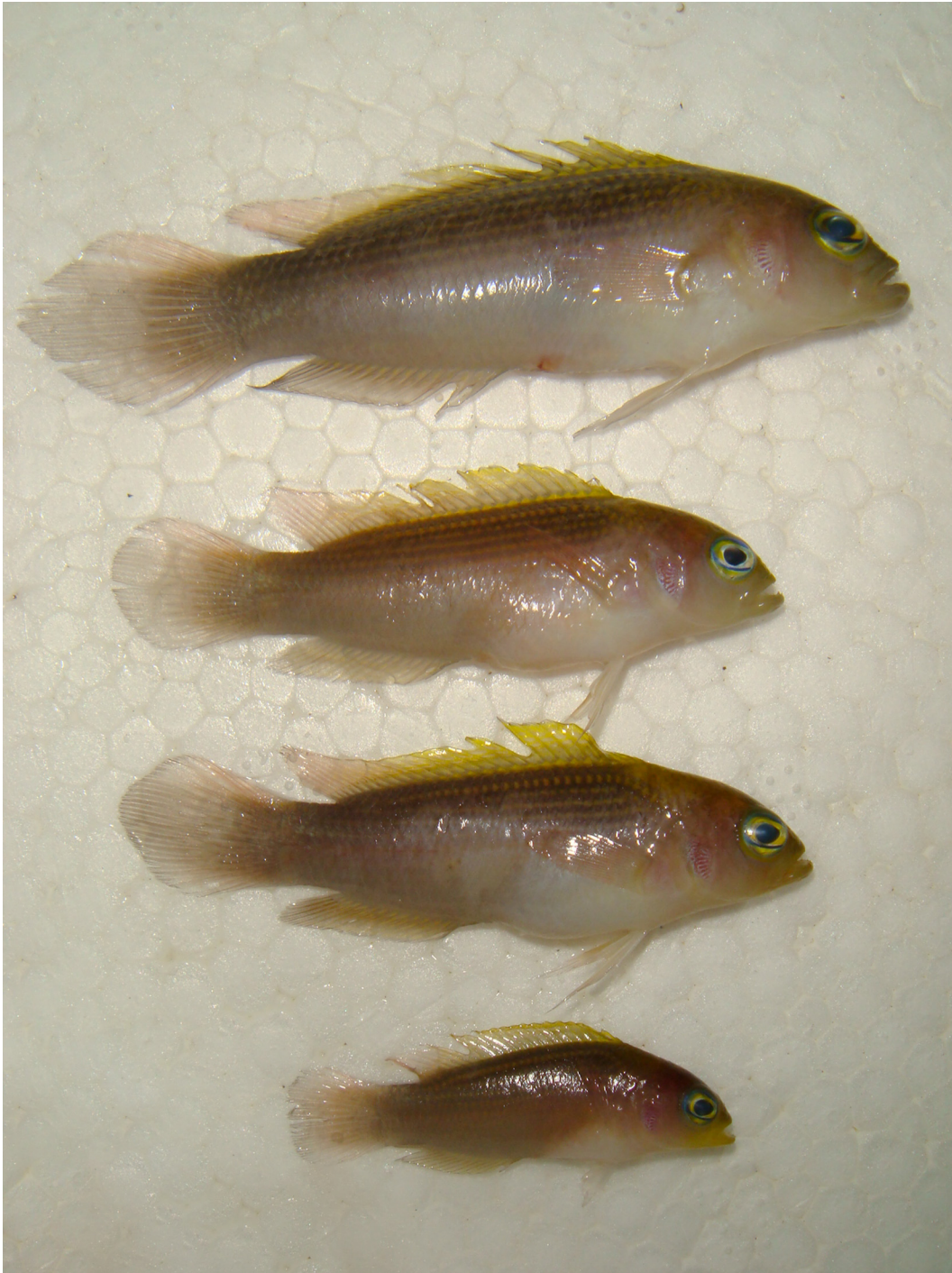
FIGURE 2. Pseudochromis stellatus, paratypes, AMS I.47330-001 (third from uppermost specimen) and WAM P.33630-001 (all other specimens), Batu Hitam, Raja Ampat Islands, Indonesia.

As percentage of SL: head length 27.2–28.6 (27.5); orbit diameter 9.7–11.8 (9.7); snout length 6.2–7.6 (6.2); fleshy interorbital width 5.4–6.0 (5.4); bony interorbital width 4.1–4.5 (4.1); body width 12.5–13.3 (12.7); snout tip to posterior tip of retroarticular bone 14.8–16.1 (14.8); predorsal length 33.5–35.7 (35.1); prepelvic length 30.7–32.6 (32.5); posterior tip of retroarticular bone to pelvic-fin origin 17.6–18.6 (18.3); dorsal-fin origin to pelvic-fin origin 31.8–33.5 (32.9); dorsal-fin origin to middle dorsal-fin ray 32.9–35.1 (35.1); dorsal-fin origin to anal-fin origin 43.5–45.2 (45.2); pelvic-fin origin to anal-fin origin 27.8–32.1 (30.5); middle dorsal-fin ray to dorsal-fin termination 23.7–26.7 (23.7); middle dorsal-fin ray to anal-fin origin 28.1–30.2 (28.6); anal-fin origin to dorsal-fin termination 34.0–37.6 (34.0); anal-fin base length 25.4–29.3 (25.4); dorsal-fin termination to anal-fin termination 16.0–17.8 (17.0); dorsal-fin termination to caudal peduncle dorsal edge 10.9–12.9 (11.6); dorsal-fin termination to