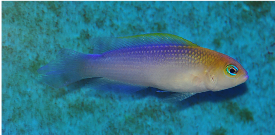
FIGURE 5. Pseudochromis sp., aquarium photo of individual from Cebu, Philippines. Note the fish was photographed under artificial lighting that has imparted a violet/blue cast on the fish.

Preserved coloration: head and body dark greyish brown dorsally, becoming pale yellowish brown ventrally; yellow spots and markings on head, body and fins become pale yellowish brown; curved blue marking behind eye becomes greyish brown; bluish grey to blue markings on fins become greyish brown.