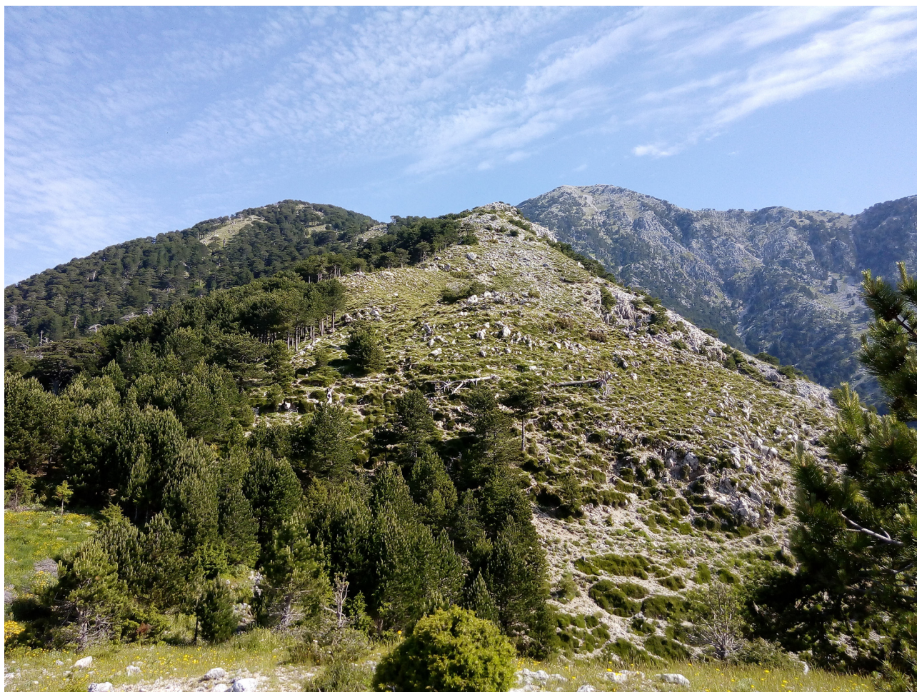
FIGURE 3. Albania, Çikës Mountains, biotope of Ahermodontus bischoffi , May 2016.

Specimens collected by A.B., T.G. & S.T. in 2016 were found in fragments and edges of old relict pine forests ( Pinus heldreichii H. Christ) (Fig. 3) and less frequently in shady places or open terrain, always between 900–1400 m – having never been encountered below or above this elevation. All specimens were collected in old, dry excrement of cattle and goat, with no fresh dung noted at this locality. There were two nearby pastures about 200 m away with both fresh and old excrement of horses, donkeys and cows, but no specimens of A. bischoffi were found there. Both specimens collected by Martin Šlachta in 2015 and Kamil Orszulik in 2016, respectively, were taken from under stones on a meadow situated near the place described above. During our studies (end of May) the species was numerous, but despite intensive search it has not been found beyond the Çikës Mountains or in immediate vicinity. Because no specimens were found in fresh dung, A. bischoffi seems to be facultative saprophagous rather than coprophagous species.