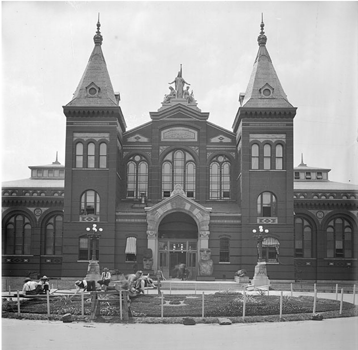
FIGURE 8. The U.S. National Museum building ca. 1900.