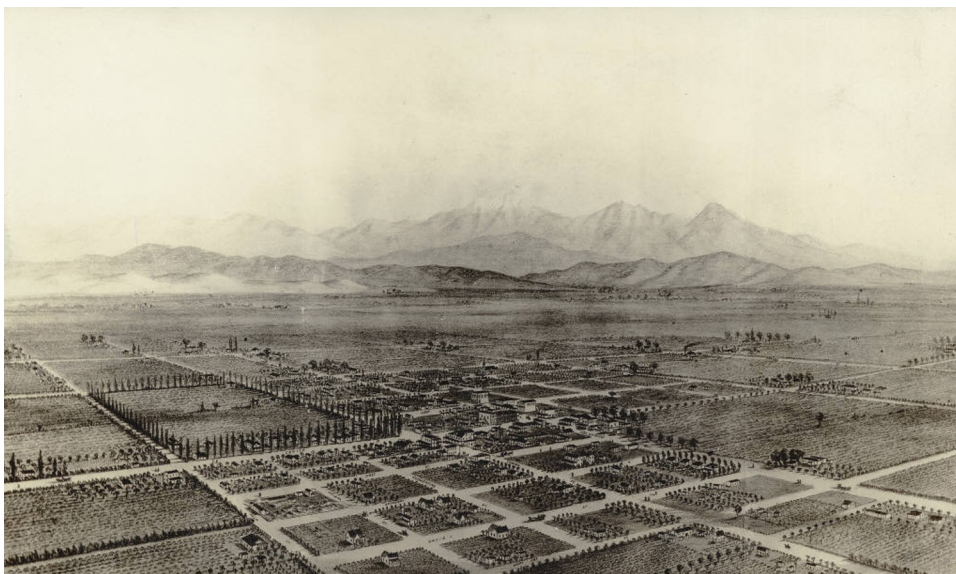
FIGURE 5. Aerial view of Anaheim area circa 1876.