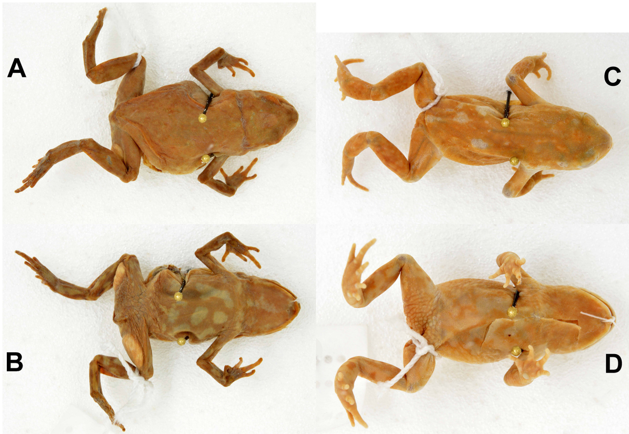
FIGURE 3. Dorsal and ventral views of the two specimens of Phryniscus australis Duméril and Bibron, 1841: A–B, MNHN RA-0.5018, C–D, MNHN RA-2008.323.

[Along the arid and sandy coasts of the lands of Leuwin, Endracht and Witt, I could not discover any species of Batrachians; I was the less surprised, as the absence of fresh water having seemed to us everywhere absolute, it was almost impossible for these aquatic animals to exist on such shores. I regretted, however, that I could not procure a single individual from this large family of reptiles, when my stay at Parramatta came to put me in a position to complete, in this respect, all my zoological studies on New Holland.]