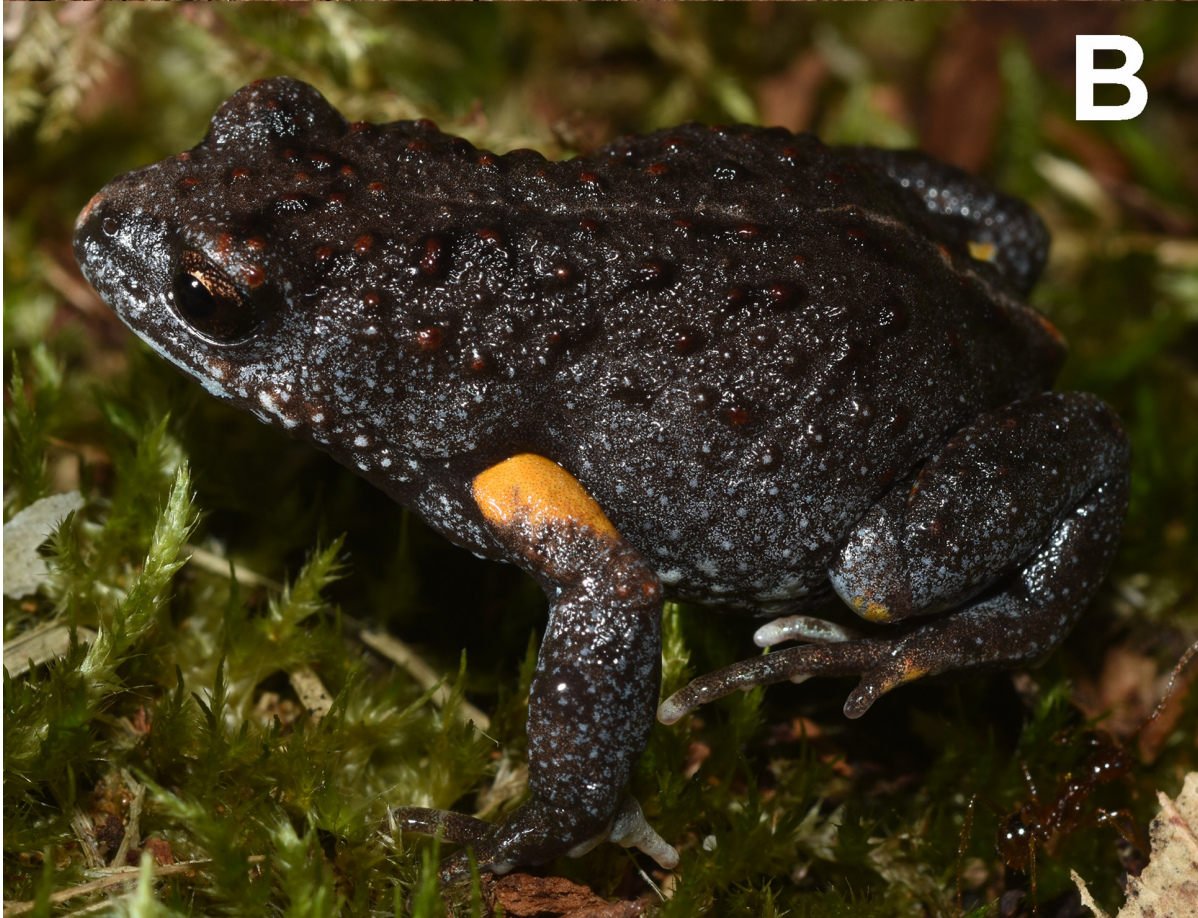
FIGURE 1. A, Pseudophryne australis from West Head, Kuringgai Chase National Park, Sydney, New South Wales, in life. B, Pseudophryne bibronii from Bridge Hill Quarry, Myall Lakes National Park, New South Wales, in life.