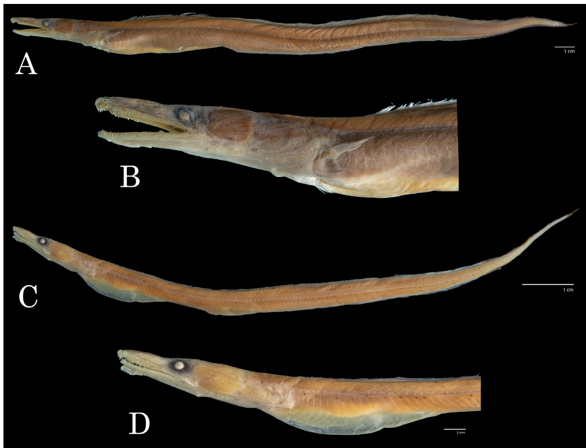
FIGURE 1. Congrhynchus talabonoides Fowler, 1934. A–B. Holotype, USNM 92350, 288 mm TL. C–D, Paratype, USNM 93348, 116 mm TL.

Island, 8°37'37"N, 124°35'E, 391 m, 4 Aug. 1909, Albatross station 5502. Paratypes: *USNM 93347 (1, 300+, immature female), Philippines, between Burias and Luzon, Anima Sola Island, 12°52'N, 123°23'30"E, 393 m, 22 Apr. 1908, Albatross station 5216. USNM 93348 (1, 116+), Philippines, Gulf of Davao, Dumalag Island (S.), 7°02'N, 125°38'45"E, 247 m, 18 May 1908, Albatross station 5247. Non-types: *NMMB-P1641, (1, 417), Donggang, Pingtung, southern Taiwan, 4 Jan. 1965, coll. T.-C. Weng. CMLRE 2801620 (1, 356+), Andaman Sea, 12°49'36"N, 93°12'46.8"E, 441 m, 17 Sep. 2010, R/V Sagar Sampada . *CMLRE 3490602, (1, 315+), Andaman Sea, 12°44'34.8"N, 93°06'18"E, 332 m, Apr. 2016. CMLRE 3490806, (1, 363+), Andaman Sea, 13°6'46.8"N, 93°1'8.4"E, 411 m, Apr. 2016. *CMLRE 3670535, (1, 345+), Andaman Sea, 12°29'43.1"N, 93°10'43.9"E, 314 m, Nov. 2017.