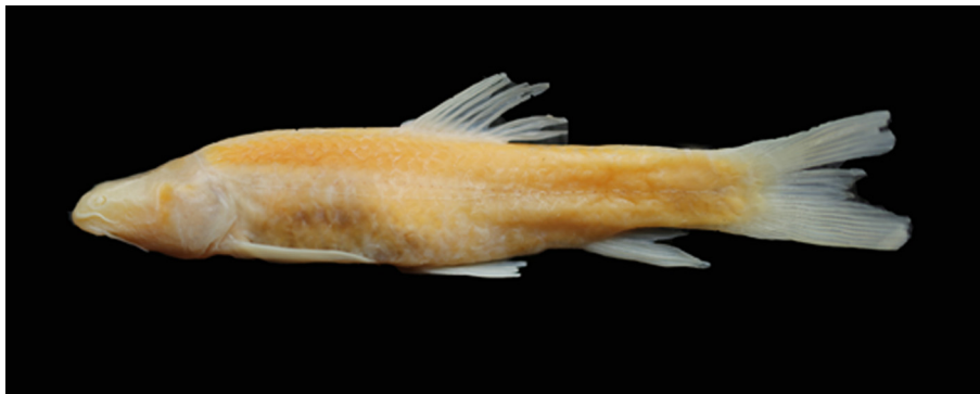
FIGURE 1. Lateral view of Speolabeo hokhanhi , IHB 2016092883, holotype 74.6 mm SL; central Vietnam, Son River basin, Hang Va Cave.