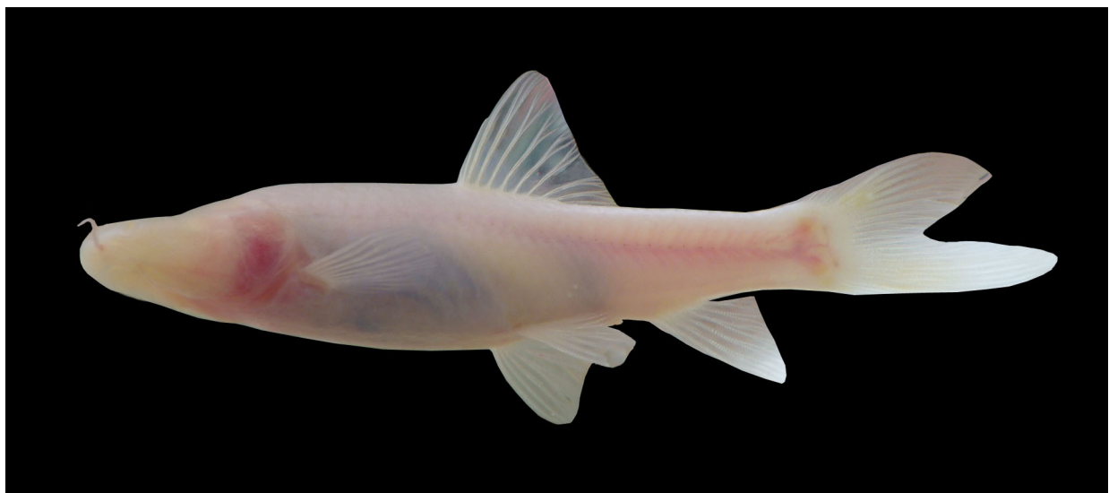
FIGURE 2. Speolabeo hokhanhi sp. nov., fresh individual immediately after capture. Lateral view.