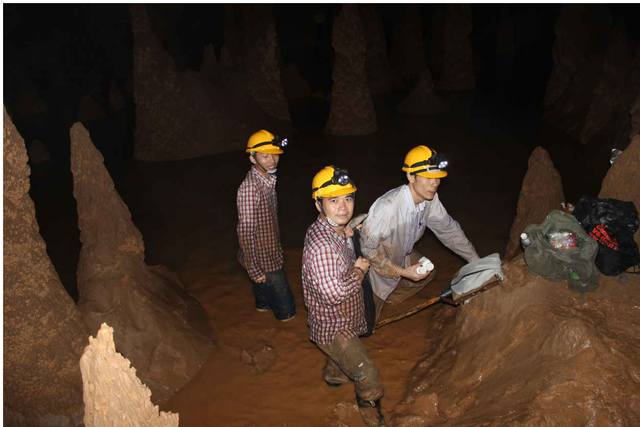
FIGURE 5. Vietnam: Son River basin: Hang Va Cave. a) habitat of Speolabeo hokhanhi , b) the pool where type specimens were collected.