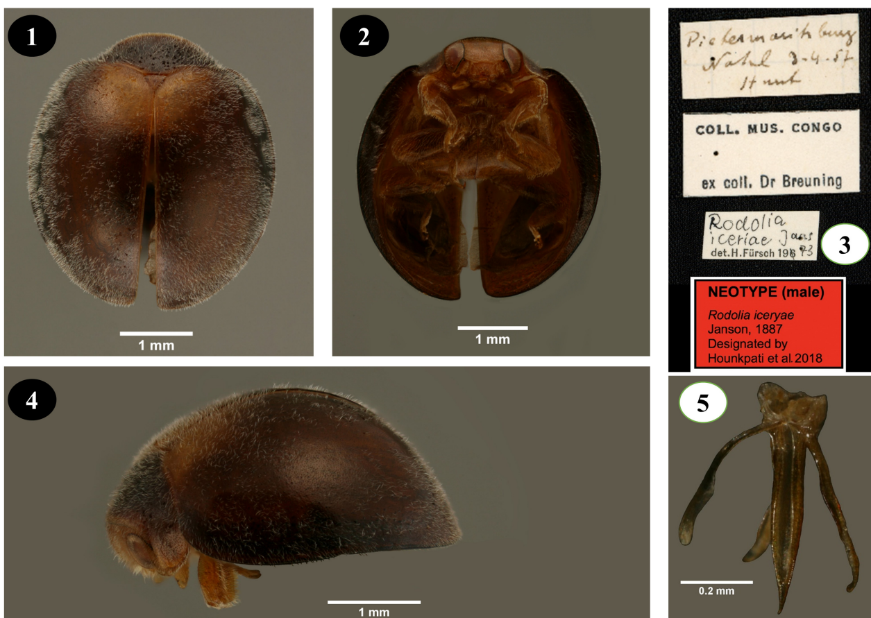
FIGURES 1–5. Neotype, Rodolia iceryae Janson in Ormerod, male: 1. Dorsal habitus, 2. Ventral habitus, 3. Specimen labels, 4. Lateral habitus, 5. Tegmen, lateral view.

Diagnosis. Rodolia iceryae can be separated from other species of Novinii by the following combination of characters: length 3-5 mm; body hemispherical, widest just posterior to middle (Fig. 1); shiny; dorsal surfaces pubescent; base of the elytra with a large semicircular blood-red spot, enclosing the scutellum; head concealed from above; humeral angles somewhat produced anteriorly, rounded, and slightly elevated.