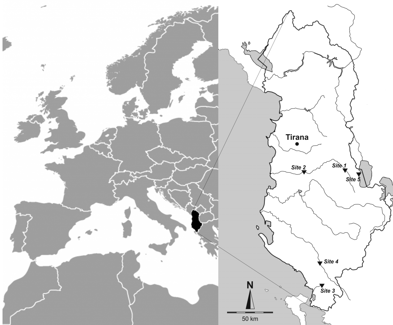
FIGURE 1. Map of Albania with marked sampling sites (see Fig. 2).

All specimens were collected and identified by the authors, and the material is deposited in the collections open to public, of either permanent slides or 75% ethanol preserved samples, in the Department of Biology and Ecology, Faculty of Natural Sciences, Matej Bel University in Banská Bystrica, Slovakia.