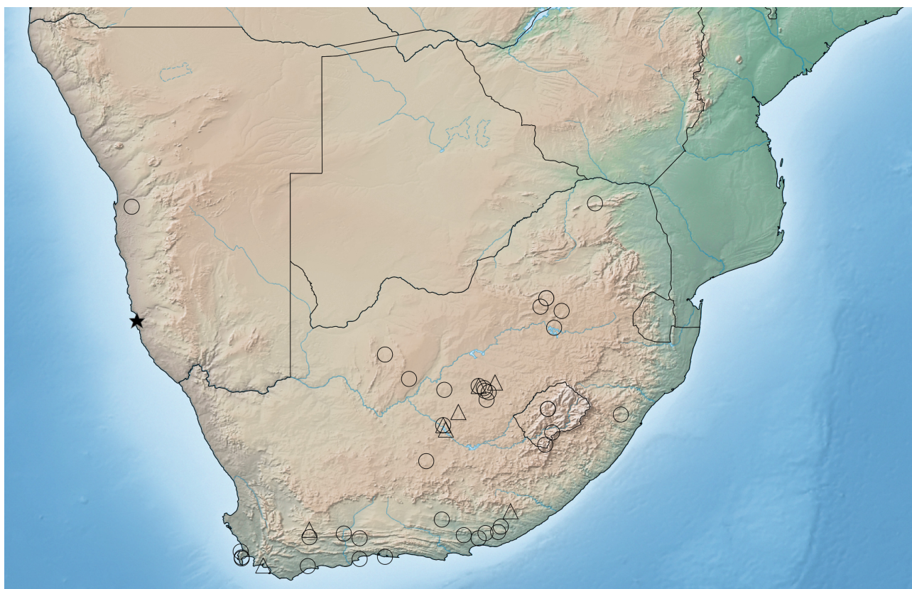
FIGURE 9. Distribution of Afrocto africana (Simon, 1910) comb. nov. : black star = type locality of Argistes africanus Simon, 1910; open circles = published records of Afrocto arca Lyle & Haddad, 2010 syn. nov. (from Lyle & Haddad 2010); open triangles = new records.

Distribution. Afrocto africana is widespread in the more mesic Grassland, Nama Karoo and Fynbos habitats of southern Africa, with only a few sporadic records from the moister eastern parts of South Africa (Fig. 9). All of the new records reported here fall within the known distribution range of the species.