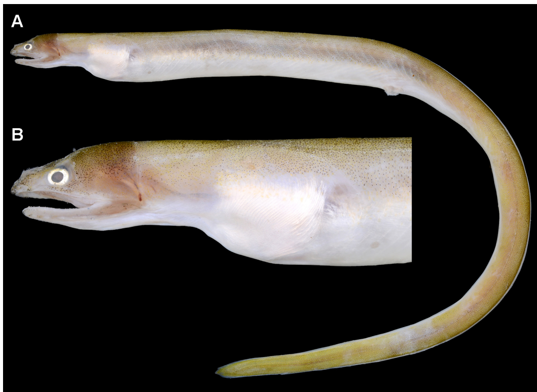
FIGURE 3. Fresh condition of Muraenichthys thompsoni , KMNH VR 100226, 209 mm TL, Dong-gang, Taiwan. A, whole body; B, enclosed view of head.

Muraenichthys malabonensis Herre, 1923: 157 (Baños pond at Malabon, Rizal Province, Manila Bay, Philippines); McCosker 2014: 339 (Philippines; with question); Hibino & Kimura 2015: 63, table 1 (only key characters).