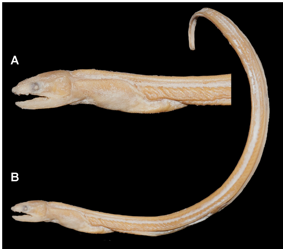
FIGURE 4. Holotype of Muraenichthys thompsoni , SU 20201, 97 mm TL, Manila Bay, Luzon, Philippines. A, enclosed view of head; B, whole body.

Head large, branchial basket weakly expanded; head 6.5–8.3 and head and trunk 2.3–2.8 in TL; snout robust, rounded, its length equal to more than twice eye diameter; ventral groove on snout absent; lower jaw included in upper jaw, its tip beyond anterior base of anterior-nostril tube; mouth large, rictus well behind a vertical from posterior margin of eye and slightly behind a vertical through posteriormost infraorbital pore, along with a groove reaching to end of jaw; eye moderate in size, 10.1–15.2 in HL, covered by a transparent skin; mid-eye located anterior to above mid-jaw (mid-point between tip of snout and end of maxilla); anterior nostril tubular, its length slightly shorter than eye diameter, somewhat anteriorly directed; inner opening of posterior nostril above upper lip, and outer opening of posterior nostril located above upper lip, anteroventral to eye, a slit-like opening towards down side with a short flap anteriorly; lips smooth or with scattered small papillae; interorbital region smooth, convex but usually without a groove or an extremely shallow depression; gill opening constricted, located ventrolaterally.