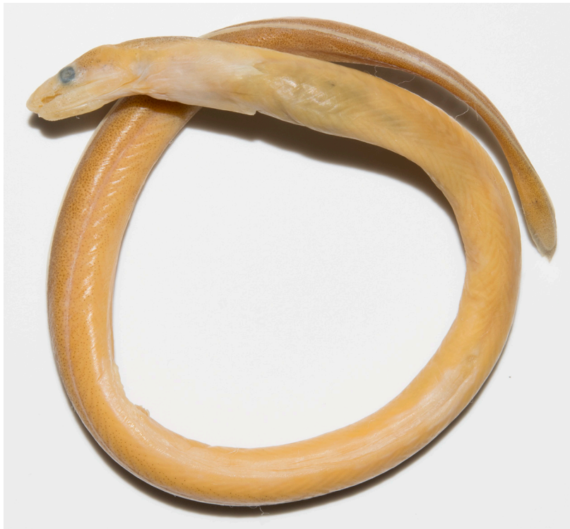
FIGURE 1. Preserved condition of Muraenichthys longirostris sp. nov., NMMB-P24388, holotype, 206 mm TL, Dong-gang, Pingtung, southern Taiwan.

Description. Counts and measurements (in mm) of the holotype: predorsal vertebrae 23; preanal vertebrae 41; total vertebrae 131; preanal lateral-line pores 42. Total length 206; head length 23.3; trunk length 45.5; tail length 137.3; predorsal length 40.9; body depth at gill opening 6.6; body depth at mid-anus 6.7; body width at gill opening 5.8; body width at mid-anus 5.9; dorsal-fin origin to anus 26.1; upper-jaw length 10.3; length of mouth gape 9.4; snout length 4.2; snout tip to tip of lower jaw 1.3; eye diameter 1.9; interorbital width 2.3; gill-opening length 1.6. Body long, subcylindrical, its depth at gill opening 31.2 in TL (Fig. 1); tail compressed posteriorly, its depth weakly reduced gradually.