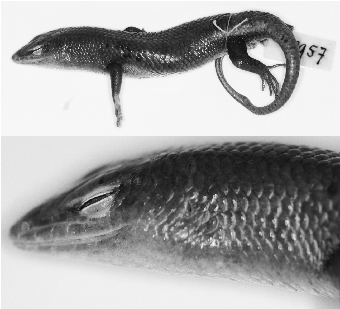
FIGURE 1. Holotype of Mabuia wirzi in dorsolateral view, with details of the lateral side of the head.

1) closely resembles that species. Particularly important in identifying Mabuia wirzi as a Dasia species are the enlarged glandular heel scales, a diagnostic feature of that genus (Greer 1970), and lacking in Eutropis , although previous definitions of Dasia record only two enlarged heel scales for species in the genus (Greer 1970; Karin et al. 2016). The simple temporal configuration of one primary temporal, not reaching the parietal, and two secondary temporals with the upper overlapping the lower and contacting the parietal (Fig. 1), is also a feature of Dasia olivacea (Fig. 2; de Rooij 1915: Fig. 77) while Eutropis multifasciata and other Eutropis species have a more complex temporal configuration (Greer & Broadley 2000; Greer & Nussbaum 2000). Grismer (2011) reports two primary temporals for D. olivacea , but this is likely to be based on a different definition of temporal scalation (possibly that of Grismer et al. 2011 for Larutia , where the scales labelled primary temporals are the equivalent of the pretemporals of Greer 1983, and the posterior supraciliary and upper postsubocular of Taylor 1936). We use Taylor's nomenclature for these scales.