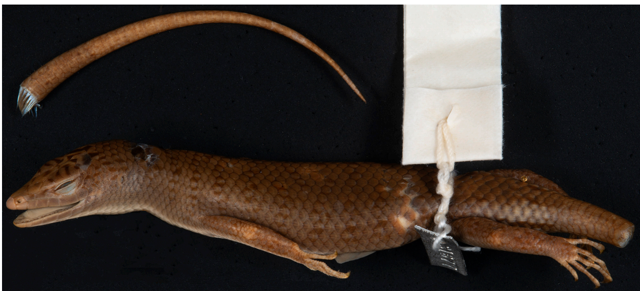
FIGURE 3. USNM 31677, the only other specimen of Dasia olivacea reported from Pulau Nias, the type locality of M. wirzi .