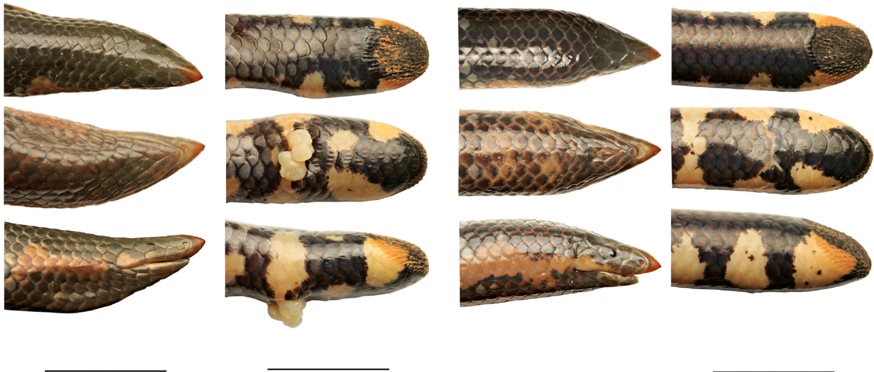
FIGURE 6. Heads and tails of two (of six) paratypes of Rhinophis melanoleucus sp. nov. Two left columns are BNHS 3537, two right columns BNHS 3538. Shown in dorsal (upper row), ventral (middle row) and lateral (lower row) views. Lateral views are of right (head) and left (tail) sides. Scale bars 10 mm.

Sexual dimorphism. There is no clear evidence of sexual dimorphism in number of ventral scales in the types, with the three females having 225–235 and three males having 218–236 (Table 1). Males tend to have proportionately slightly longer tails (2.6–3.5 % of total length) than females (2.3–2.8 %) and have more subcaudals (7,7 or 8,8) than females (6,6 or 6,7). Both females and males have ridges on scales on the underside of the tail and posteriormost part of the body, but these are more prominent in males.