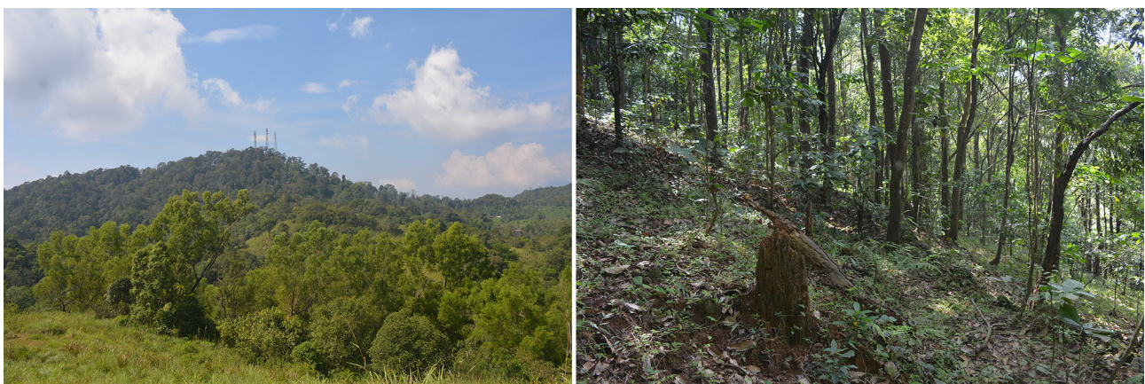
FIGURE 7. Habitat in the vicinity of Lakkidi, Wayanad district, Kerala, India, the type locality of Rhinophis melanoleucus sp. nov. Left photograph shows general habitat of upland moist forest and grassland, right photograph shows floor of forest where R. melanoleucus have been found.