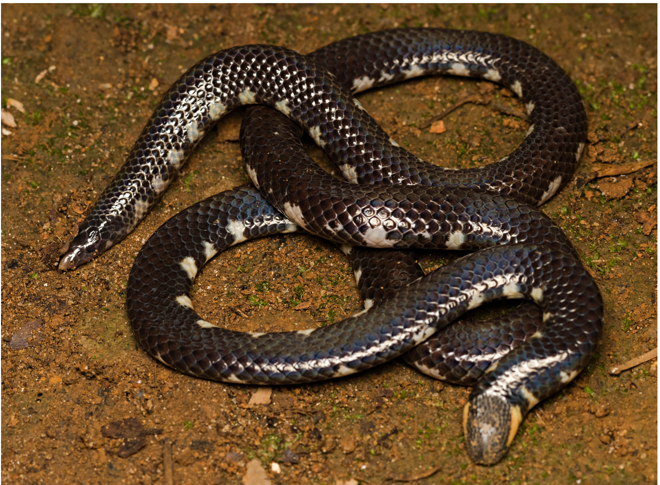
FIGURE 3. Holotype (BNHS 3534: total preserved length 461 mm) of Rhinophis melanoleucus sp. nov. in life.

Colour in life (Fig. 3). Dorsal surface uniformly glossy blackish and somewhat iridescent. Lateral and ventral pale blotches on body whitish, more purely so on mid and posterior of body than anteriorly (where whitish scales appear translucent so that darker spots beneath scales slightly visible). Head scales blackish except for paler, orange-brownish rostral and whitish lower and/or posterior parts of supralabials. Ventral surface of tail blackish except for whitish ventrolateral markings. Pale elongate markings on tail shield pale orange, paler and more whitish anteriorly than posteriorly.