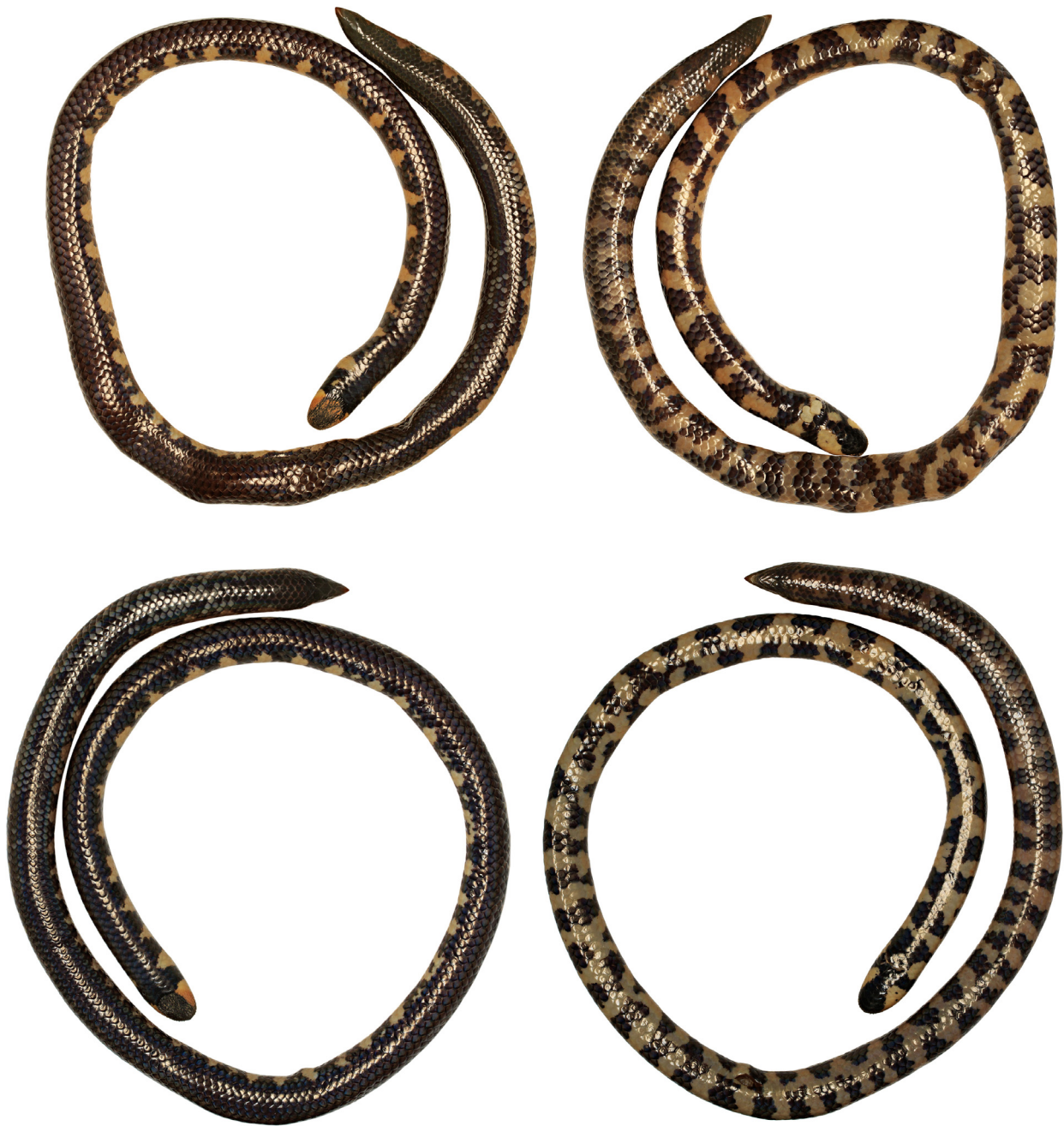
FIGURE 5. Two (of six) paratypes of Rhinophis melanoleucus sp. nov. Upper row BNHS 3537, lower row BNHS 3538; left column dorsal view, right column ventral view. Not to same scale; total length of BNHS 3537 303 mm, of BNHS 3538 357 mm.

(BNHS 3535, BNHS 3536, ZSI/WGRC/IR/V/3100). Rostral length from approximately 5 (ZSI/WGRC/IR/V/3100) to 14 (ZSI/WGRC/IR/V/3101) times distance between rostral and frontal. Eye diameter approximately 0.2–0.25 times length of ocular shield.