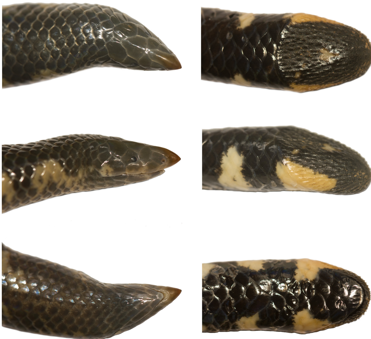
FIGURE 2. Views of the head (left) and tail (right) of the holotype (BNHS 3534) of Rhinophis melanoleucus sp. nov. , shown in dorsal (upper), lateral (middle) and ventral (lower) views. Not to same scale; see Table 1 for size of specimen.

Dorsal scale rows (i.e., excluding subcaudals) 15 at level of first subcaudals. Paired anal scales (right overlying left) considerably larger than posteriormost ventrals and subcaudals. Distal margin of each anal overlaps four (left) and three (right) small scales in addition to anteriormost subcaudals. Six subcaudals on each side, the posteriormost undivided. Some scales at posterior end of specimen bear low, short parallel ridges, towards posterior edges—on last few ventrals, small scales overlapped by anals, lower two or three dorsal scale rows of posterior of body and