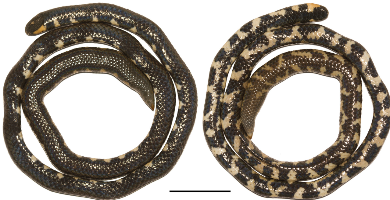
FIGURE 1. Dorsal and ventral view of the holotype (BNHS 3534) of Rhinophis melanoleucus sp. nov. Scale bar 25 mm.