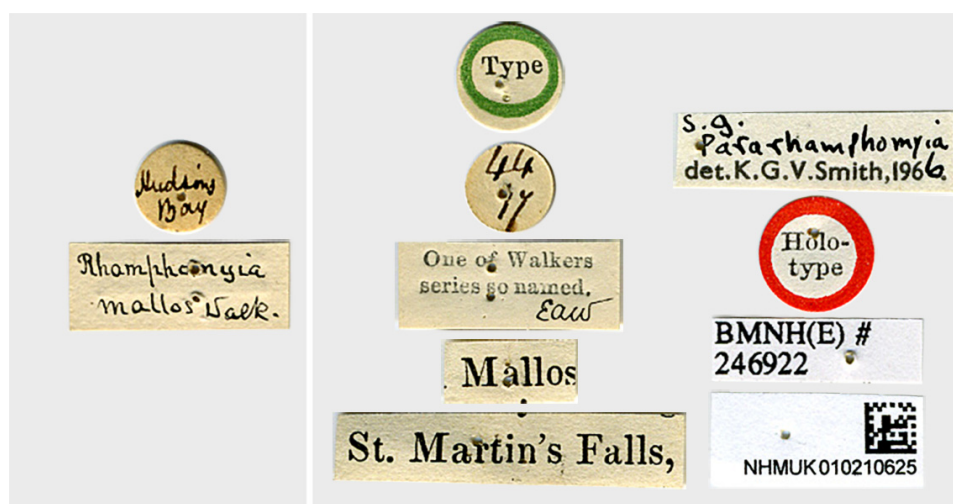
FIGURE 4. Labels of the type of Rhamphomyia mallos Walker (Diptera), shown in Sinclair & Saigusa (2018, p. 135, fig.13). The left two labels show the underside of the corresponding labels in the center. Used with permission.

Presented by Geo Barnston Esq. These insects were collected by the donour. The numbers + MS names refer to a list not sent with the insects; most of the names from the want of books are not to be depended on, so far as the genera are concerned