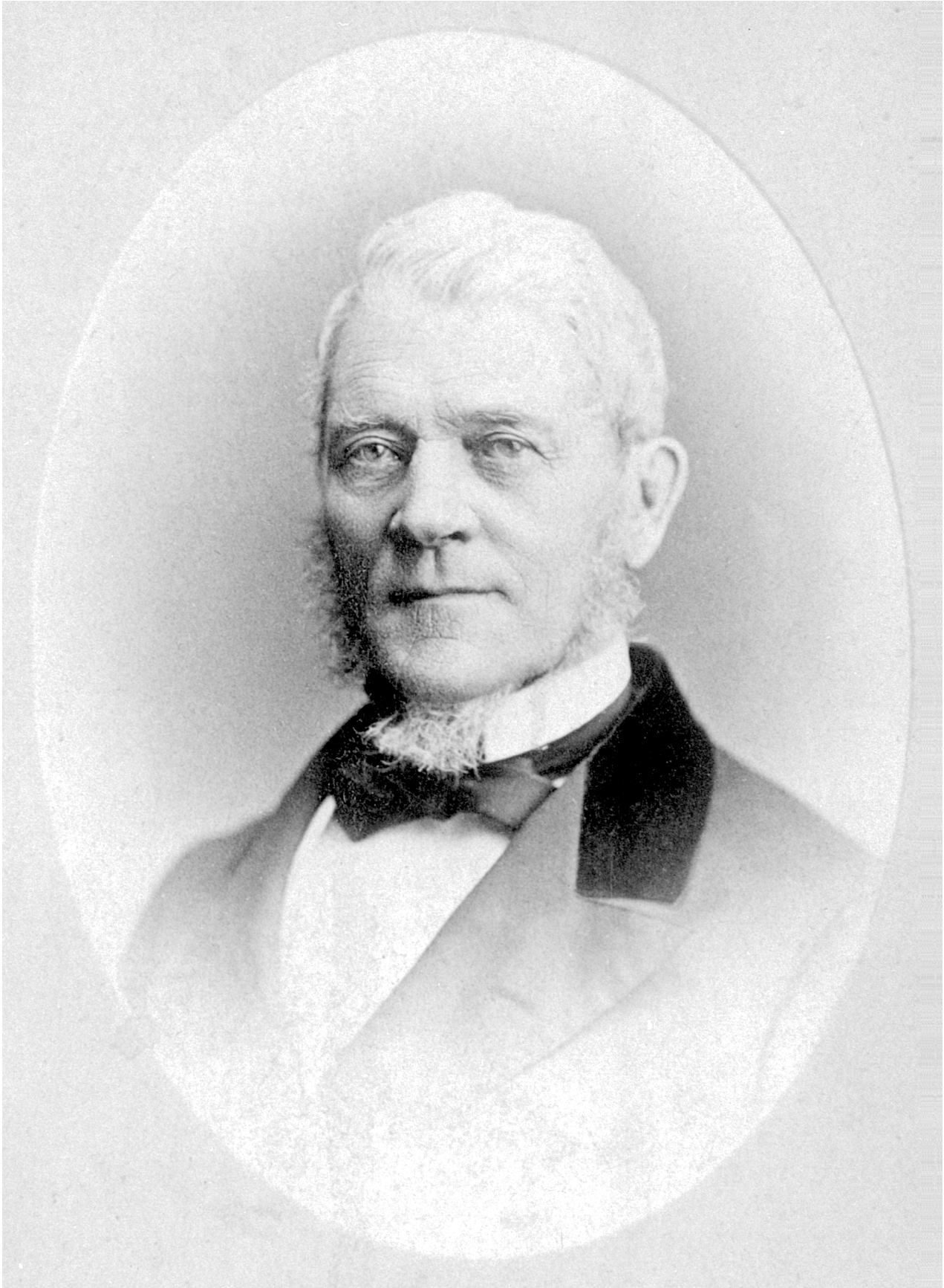
FIGURE 3. Photograph of George Barnston, circa 1858 when in office as chief factor of the Hudson's Bay Company in the Saguenay. Image B-00101, courtesy of the Royal BC Museum and Archives, used with permission.