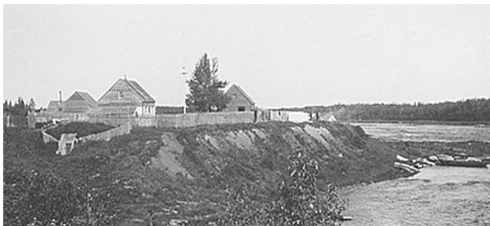
FIGURE 2. Martin's Falls Trading Post in 1829 (photograph courtesy of the Estate Gary Still, with authorisation) ( www.redriver-ancestry.ca/CORRIGAL-JACOB-1773.php , last accessed April 15, 2019).