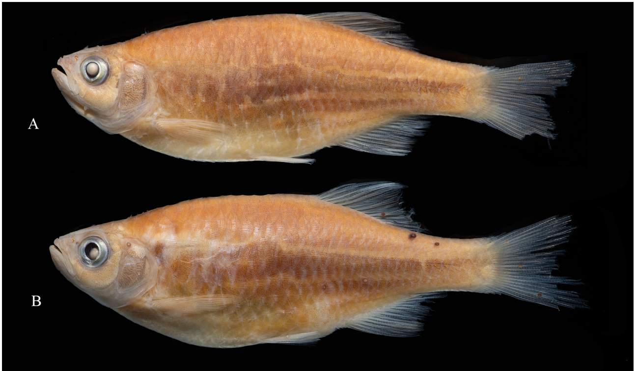
FIGURE 2. Devario browni . BMNH 1907.10.22:1–4; A , Lectotype, male 57.0 mm SL; B , Paralectotype, female, 52.5 mm SL; Northern Shan States.

Revised definition. Distinguished from all other species of Devario by the shape of the P stripe: gradually expanding posteroanteriorly, either forming a uniform brown blotch anteriorly, or P stripe diverging anteriorly, forming a brown blotch enclosing a small light spot or two contiguous small light spots.