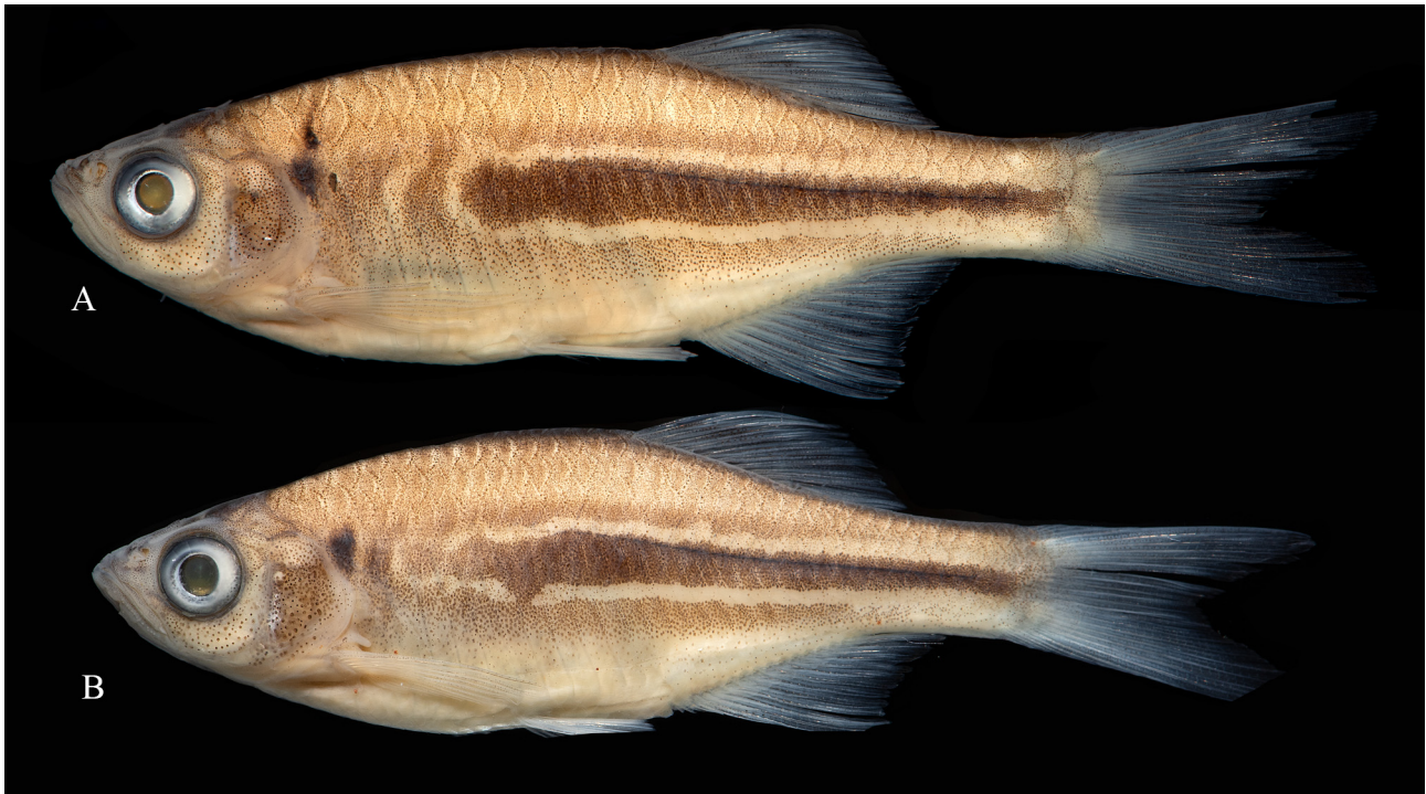
FIGURE 6. Devario ahlanderi , subadult paratypes. A , 42.0 mm SL; B , 36.9 mm SL; both from Myanmar, Shan State, small stream running under Naung Pic bridge near Naung Pic Village, on the way from Kak-ku to Taunggyi.

Adult flank colour pattern (Fig. 4) varying with specimen size, and slightly on each side. Adults with black P stripe along middle of side from slight widening at end of caudal peduncle, running cephalad with irregular margins and increasing slightly in width anteroposteriorly; from about level of dorsal-fin anterior insertion replaced by black, irregularly shaped spots (rounded or as short vertical bars); anterior two spots much lighter and smaller than remainder. P-1 stripe narrower than P stripe; irregular, brown, extending from end of caudal peduncle cephalad to about vertical from anterior insertion of dorsal fin, where broken up in irregular spots paralleling or interdigitating with P stripe spots. P-2 stripe indistinct, grading into light abdomen. P+1 stripe extending from end of caudal peduncle, narrower than P stripe but wide medially and tapering in width at ends; consisting of brown blotches paralleling or interdigitating with P stripe blotches. Dorsal fin distally without pigment, basally light grey, translucent. Anal fin not pigmented. Middle rays of caudal fin light grey, fading posteriorly on fin. Pelvic fin white, translucent.