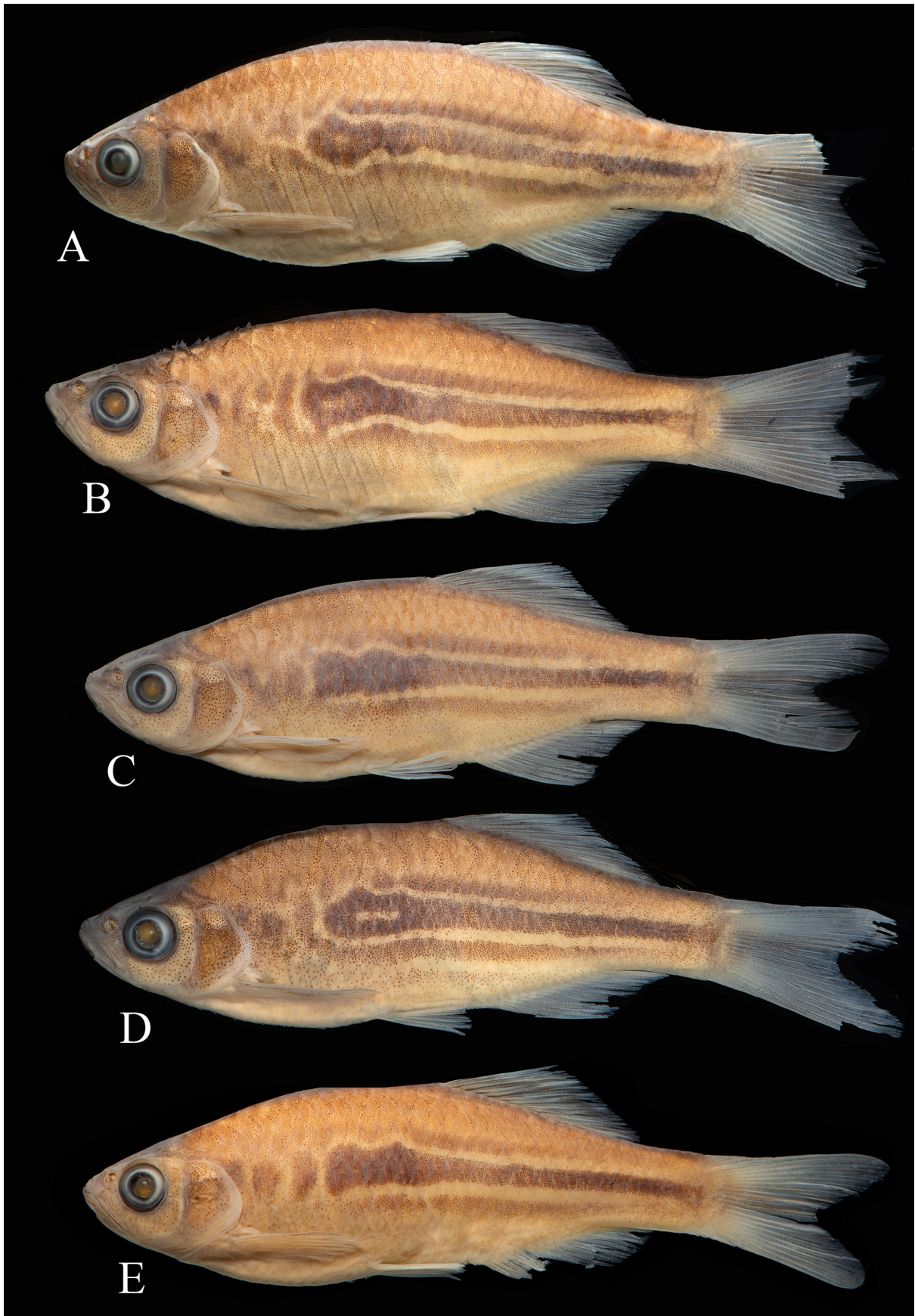
FIGURE 3. Devario browni . A , NRM 36393, adult male, 62.1 mm SL, reversed; B , adult female, 58.3 mm SL, reversed; C , young male, 44.9 mm SL, reversed; D , young male, 49.5 mm SL; E , NRM 36361, young male 49.7 mm SL. All from Myanmar, Shan State, Irrawaddy River basin, Lawe Pyat stream, on Road Lashio–Tigyaing.