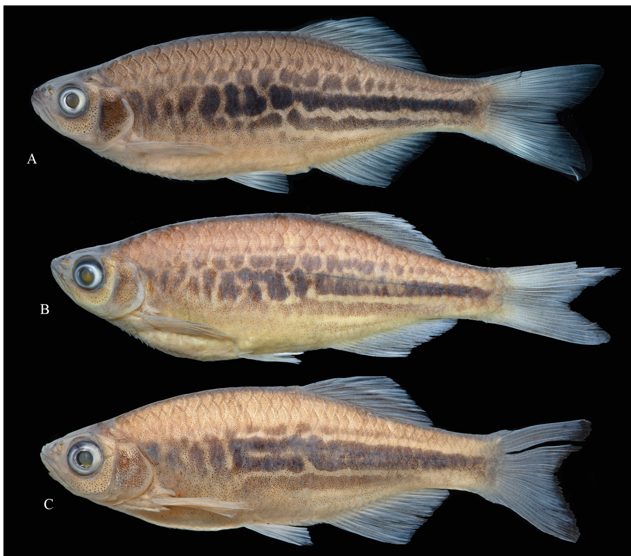
FIGURE 4. Devario ahlanderi . All from Myanmar, Shan State, Salween River basin. A , holotype, NRM 57999, adult female, 65.2 mm SL; stream close to Naung Ai Village, about 6 miles (9 km) east of Kak-ku. B , paratype, NRM 58062, adult male, 56.9 mm SL, same locality as holotype; C , paratype, NRM 58061, adult female, 55.6 mm SL; small stream running under Naung Pic bridge near Naung Pic Village, on the way from Kak-ku to Taunggyi.

Dorsal fin inserted at highest point of dorsum, distinctly posterior to middle of body. Anal fin inserted below anterior rays of dorsal fin. Pectoral-fin insertion at about vertical through posterior margin of osseous opercle; extending to pelvic-fin insertion. Pectoral axial lobe well developed. Pelvic fin inserted slightly anterior to midbody, not reaching to anterior insertion of anal fin. Pelvic axillary scale present. Caudal fin forked, lobes of about equal length, tips rounded.