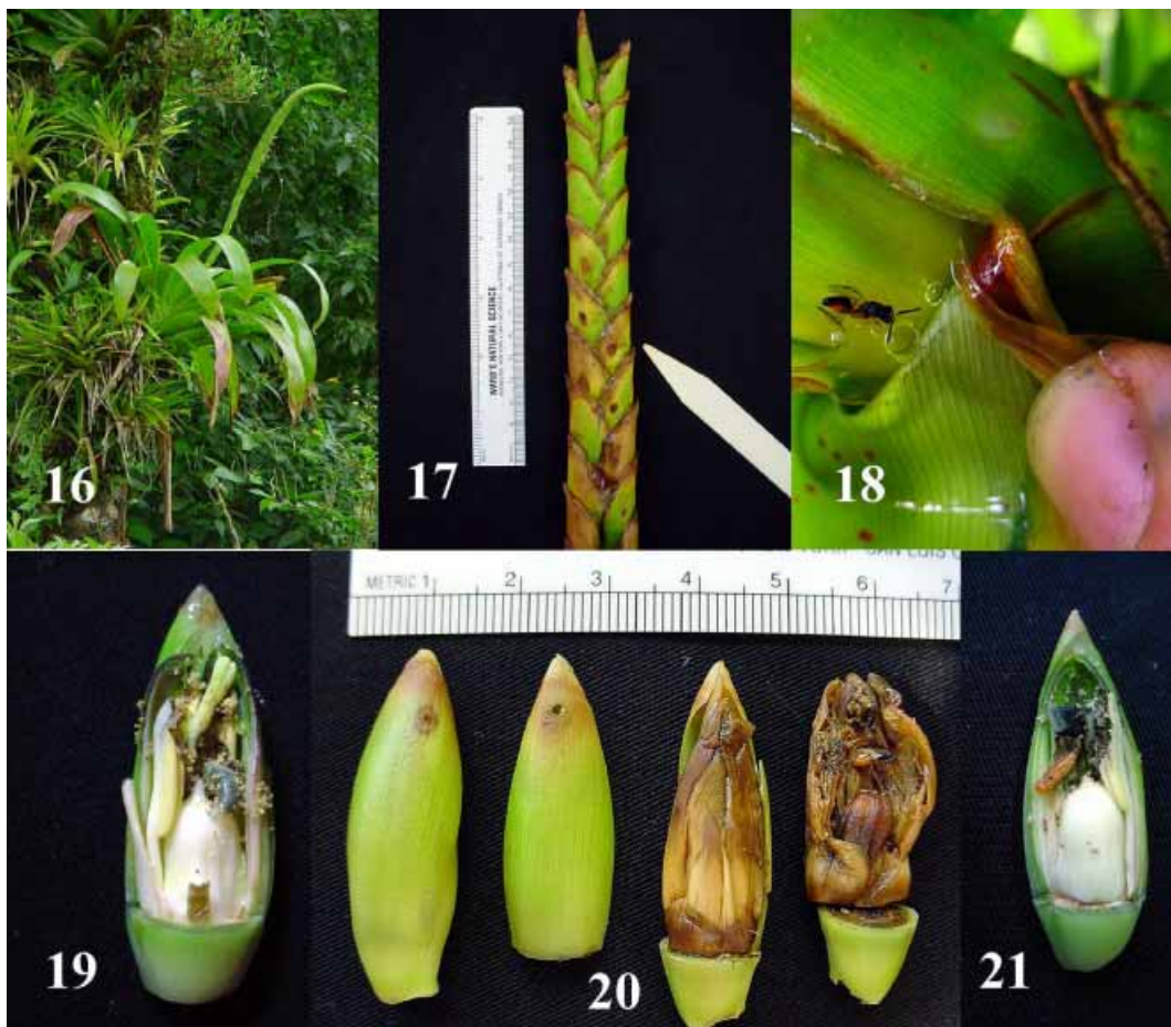
FIGURES 16–21. Werauhia gladioliflora : 16, flowering specimen, in situ; 17, infested inflorescence; 18, male of E. werauhia drowned in bract mucilage; 19, dissected floral bud with E. werauhia larva; 20, floral buds with damage by E. werauhia : emergence holes and necrotic interiors; 21, dissected floral bud with E. werauhia pupa.

Distribution .—Known from a single locality in Costa Rica.