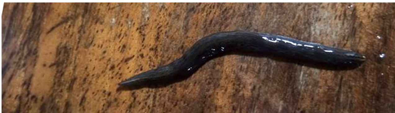
FIGURE 1. Photo of a live specimen of Obama nungara , taken in Petite France in the commune of Saint Paul, La Réunion. taken 10 June 2021. The specimen is brown on the back, with darker brown striae, a reddish tip, and with a cream stripe running a short distance from the head towards the tail, but which soon disappears into the general colour of the back.

climatic suitability ( > 0.8 ). Based on the analysis of the model's response curves (Fourcade, 2021), it appears that the limiting factor was mainly the mean temperature of the warmest quarter (BIO 10 bioclimatic variable), coastal areas being too warm while high-altitude areas are too cold. It is noteworthy that all three localities where O. nungara specimens were found are inside zones of high suitability (Plaine des Grègues: 0.92; Petite France: 0.89; Gîte de la Bergerie: 0.73).