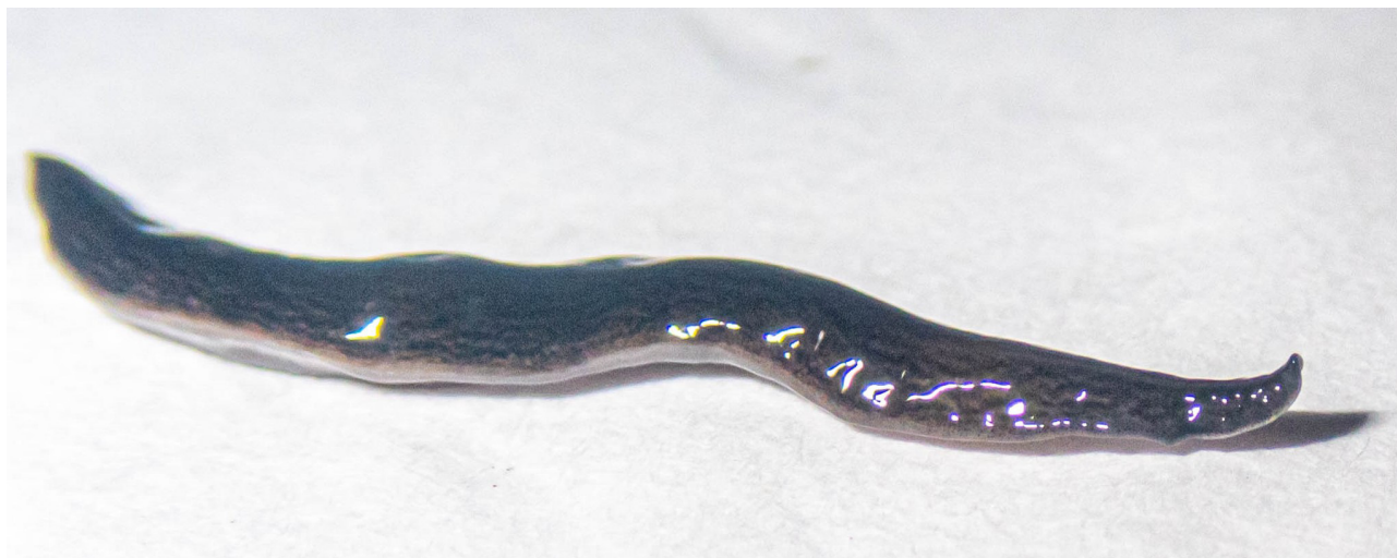
FIGURE 2. Photo of a live specimen of Obama nungara , taken in la Plaine des Grègues in the commune of Saint Joseph, La Réunion. Specimen collected 22 April 2021 by Renaud Hoarau, photograph taken by Nicolas Huet. The photo clearly shows the dark brown striae on the brownish coloured back, and the whitish under surface.