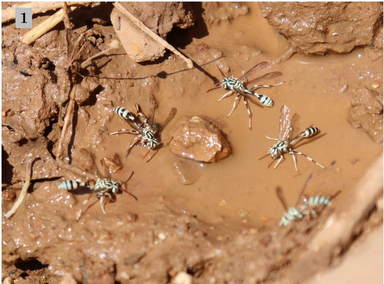
FIGURE 1. Parapolybia escalerae adult females on the water source.

General distribution: Eastern (Iran, Pakistan) and Western Palaearctic (Turkey) (Yildirim & Kojima, 1999; Rahmani et al. , 2020).