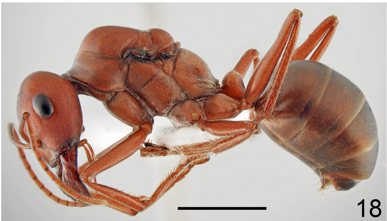
FIGURES 17, 18. Paratype gyne of Cataglyphis aphrodite n. sp. 17 dorsal 18 lateral (scale bar = 2 mm).