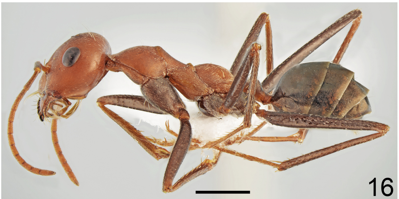
FIGURES 15, 16. Paratype minor worker of Cataglyphis aphrodite n. sp. 15 dorsal 16 lateral (scale bar = 1 mm).