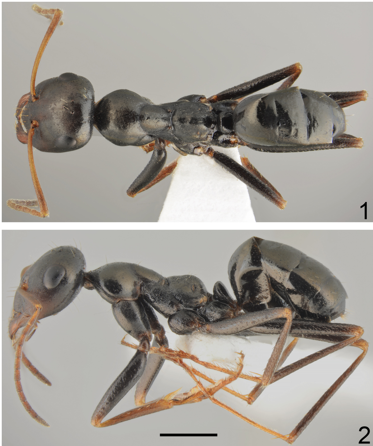
FIGURES 1, 2. Holotype major worker of Cataglyphis chionistræ n. sp. 1 dorsal 2 lateral (scale bar = 1 mm).

Description. Major worker (n=8): Measurements. HL: 1.464 (1.35–1.51); HW: 1.193 (1.09–1.26); SL: 1.551 (1.42–1.64); EL: 0.430 (0.41–0.45); PW: 0.965 (0.94–1.00); PRL: 0.778 (0.70–0.82); PRW: 0.681 (0.64–0.71); PTH: 0.448 (0.40–0.49); PTW: 0.226 (0.21–0.24); WL: 2.085 (2.00–2.15); HFL: 2.069 (2.00–2.17); CI: 1.228 (1.183–1.265); SI: 1.301 (1.262–1.344); PI: 1.983 (1.708–2.143); FI: 0.992 (0.972–1.029).