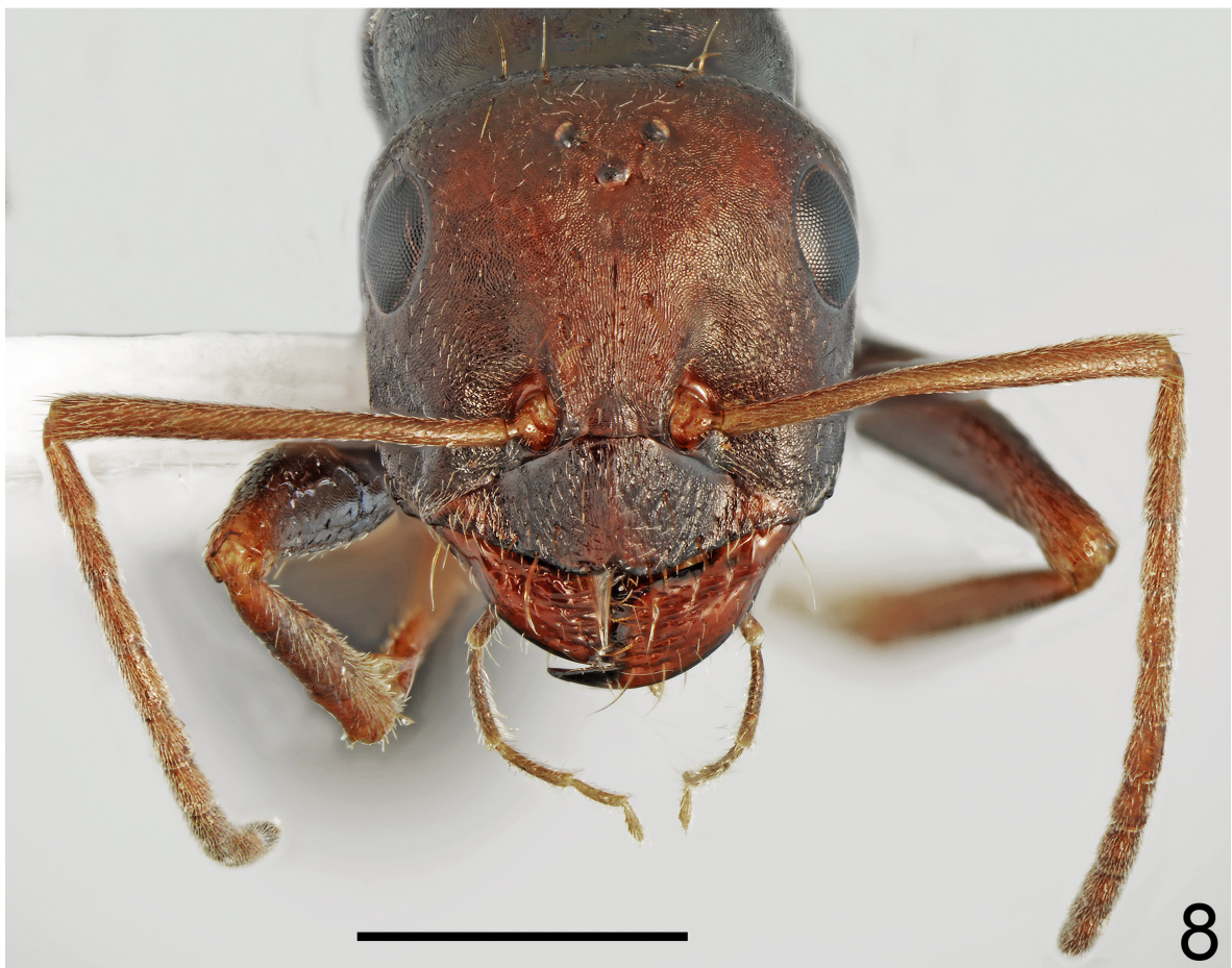
FIGURES 7, 8. Head of Cataglyphis chionistræ n. sp. 7 holotype major 8 paratype gyne (scale bar = 1 mm).