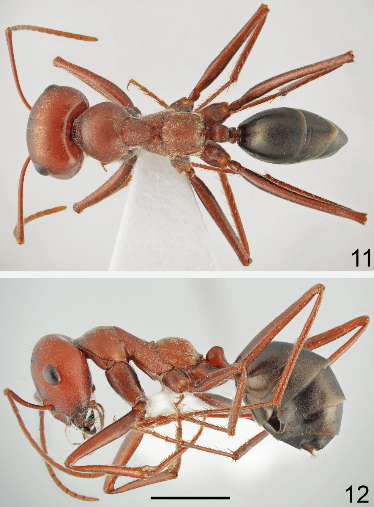
FIGURES 11, 12. Holotype major worker of Cataglyphis aphrodite n. sp. 11 dorsal 12 lateral (scale bar = 2 mm).

Etymology. Named after Aphrodite, the ancient Greek goddess associated with love, lust, beauty, pleasure, passion, and procreation. Cyprus is one of the main cult centres of Aphrodite, and according to mythology, she is usually said to have been born near her chief centre of worship, Paphos, the terra typica for this species.