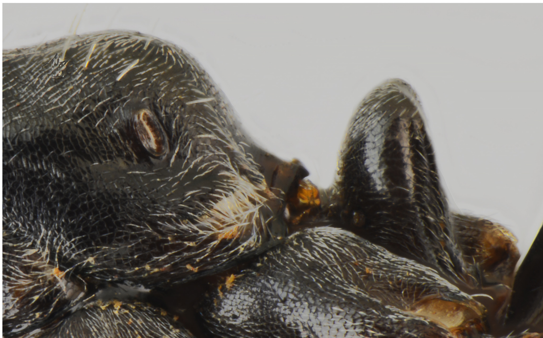
FIGURES 3, 4. Holotype major of Cataglyphis chionistræ n. sp. 3 clypeus and mandibles 4 propodeum and petiole (not in scale).