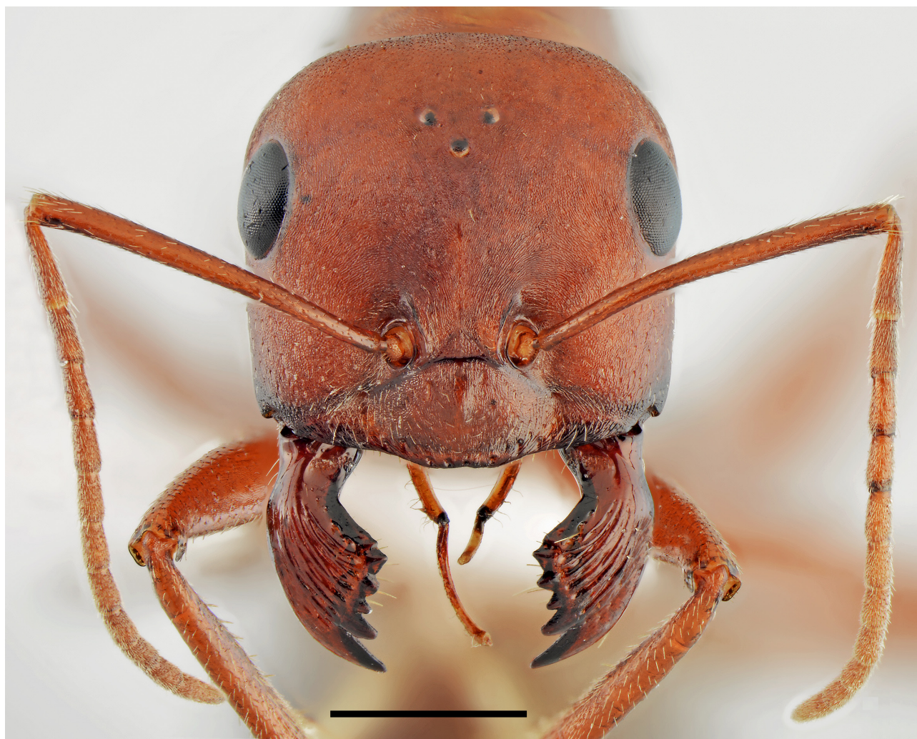
FIGURE 19. Paratype gyne of Cataglyphis aphrodite n. sp., head (scale bar = 1 mm).

Type material examined. Holotype (pinned): major worker: CYPRUS, Paphos, 424 m | Agiou Neofytou Mon. | 34.84602 / 32.44784 | 29 IV 2022, L. Borowiec (MNHW).