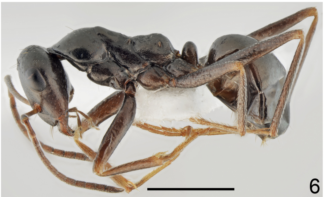
FIGURES 5, 6. Paratype minor worker of Cataglyphis chionistræ n. sp. 5 dorsal 6 lateral (scale bar = 1 mm).