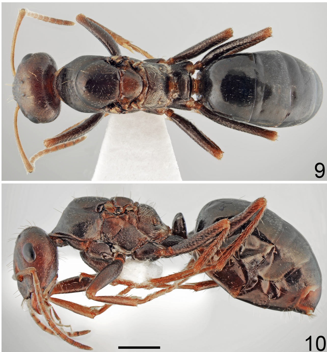
FIGURES 9, 10. Paratype gyne of Cataglyphis chionistræ n. sp. 9 dorsal 10 lateral (scale bar = 1 mm).

Color. Whole body black (Figs. 1, 10); in a few examined specimens the frontal part of the head and gena were slightly paler colored, brownish black but the rest of the body was always deep black; legs bicolored, coxa, trochanters, and femora black, only knee yellowish to yellowish brown, tibiae yellowish brown to brown, usually fore tibiae paler colored than mid and hind tibiae, tarsi yellow. Antennae yellow to yellowish brown (Figs. 1, 2, 7). Head. Almost square, approximately 1.23 x as long as wide, sides below eyes slightly converging anterad, above eyes gently convex, posterior margin slightly convex (Fig. 7). Anterior clypeal margin convex, without shallow median emargination, with a row of very short setae and of 6–8 long yellowish-brown setae, the longest 0.6 x as long as than clypeal length. Clypeal plate with very sparse yellow appressed pubescence, anteriorly with additional few decumbent short setae, basally with a pair of long erect setae as long as 1/3–1/2 length of clypeus. Clypeus densely and finely microreticulated, slightly dull, at least basal half of clypeus with additional thin longitudinal striation (Fig. 3). Eyes large and oval, approximately 1.4–1.5 x as long as wide, and 0.8 x as long as gena. Frontal