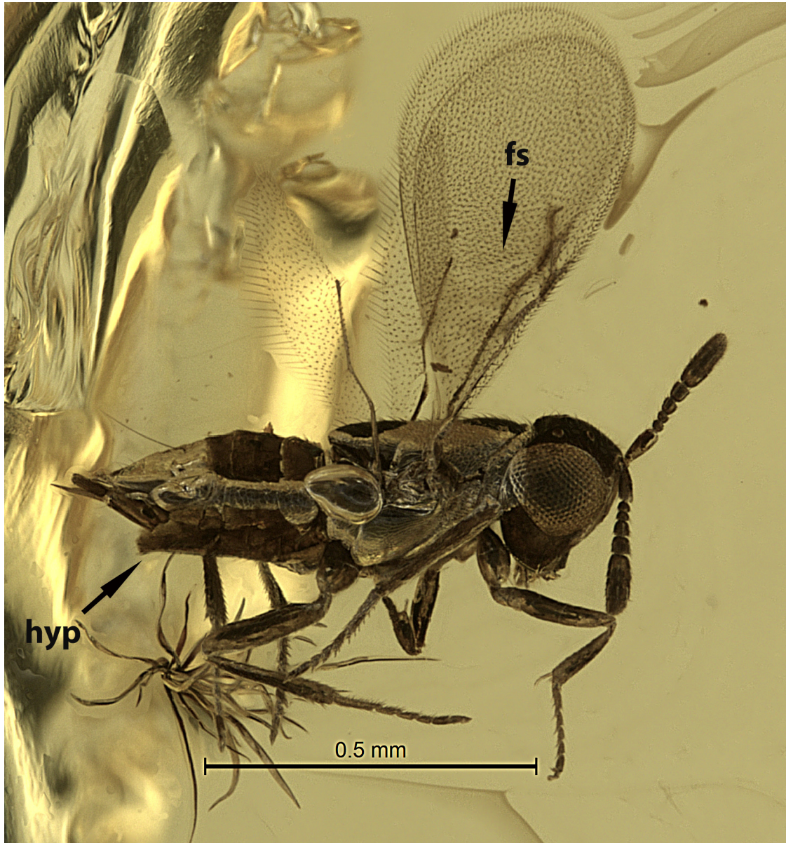
FIGURE 1. Electrocerus brevifuniculatus gen. et sp. nov., holotype female, lateral view (fs—filum spinosum, hyp—hypopygium). Scale bar: 0.5 mm.

Efesus trufanovi Simutnik, 2020; Ektopicercus punctatus Simutnik, 2020; and Protaphycus shuvalikovi Simutnik, 2022. We describe another one in the present paper and provide a key to described genera of Eocene Encyrtinae from European ambers. The new taxon, like all previously described Eocene Encyrtidae, is characterized by a long marginal and stigmal vein in the forewing, a distinctly thickened parastigma, a short radicle, and a seta on the apex of the postmarginal vein not longer than any other on this vein. It differs from all known fossil and the majority of extant encyrtids, in particular, by its four-segmented funicle.