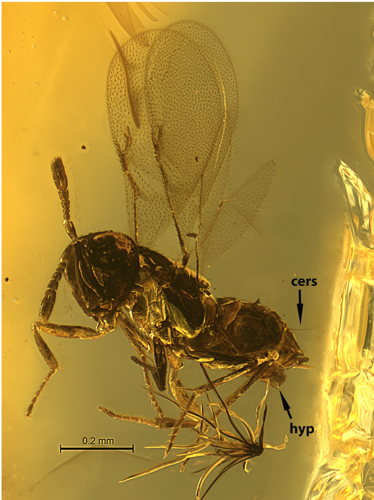
FIGURE 2. Electrocerus brevifuniculatus gen. et sp. nov., holotype female. A body, anteroventrolateral view (cers—cercal seta, hyp—hypopygium). Scale bar: 0.2 mm.

The key does not include the genus Glaesus Simutnik, 2014, which is only known from a male specimen. Its postmarginal vein is longer than the marginal vein.