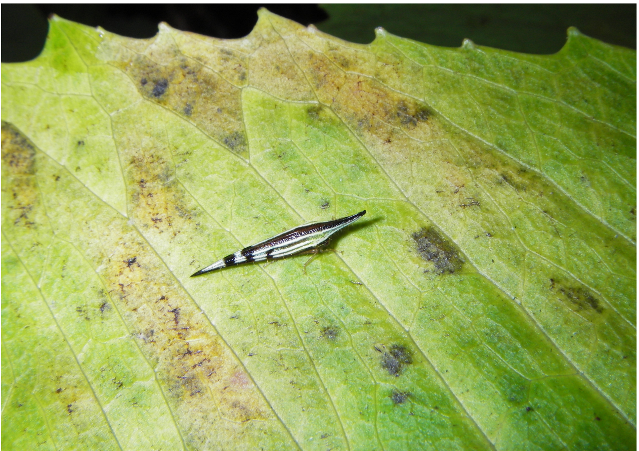
FIGURE 1. Polyglypta dorsalis Burmeister taken at Fortuna Dam, Chiriqui Province, Panama.