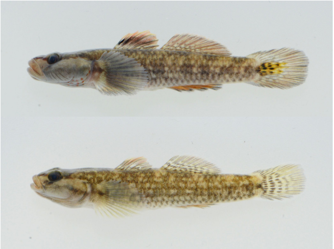
FIGURE 1. Rhinogobius jangshiensis , new species, upper one: male, holotype, 33.6 mm SL; lower one: female, paratype, 30.0 mm SL, the Jangshi basin, Fujian Province, PR China.