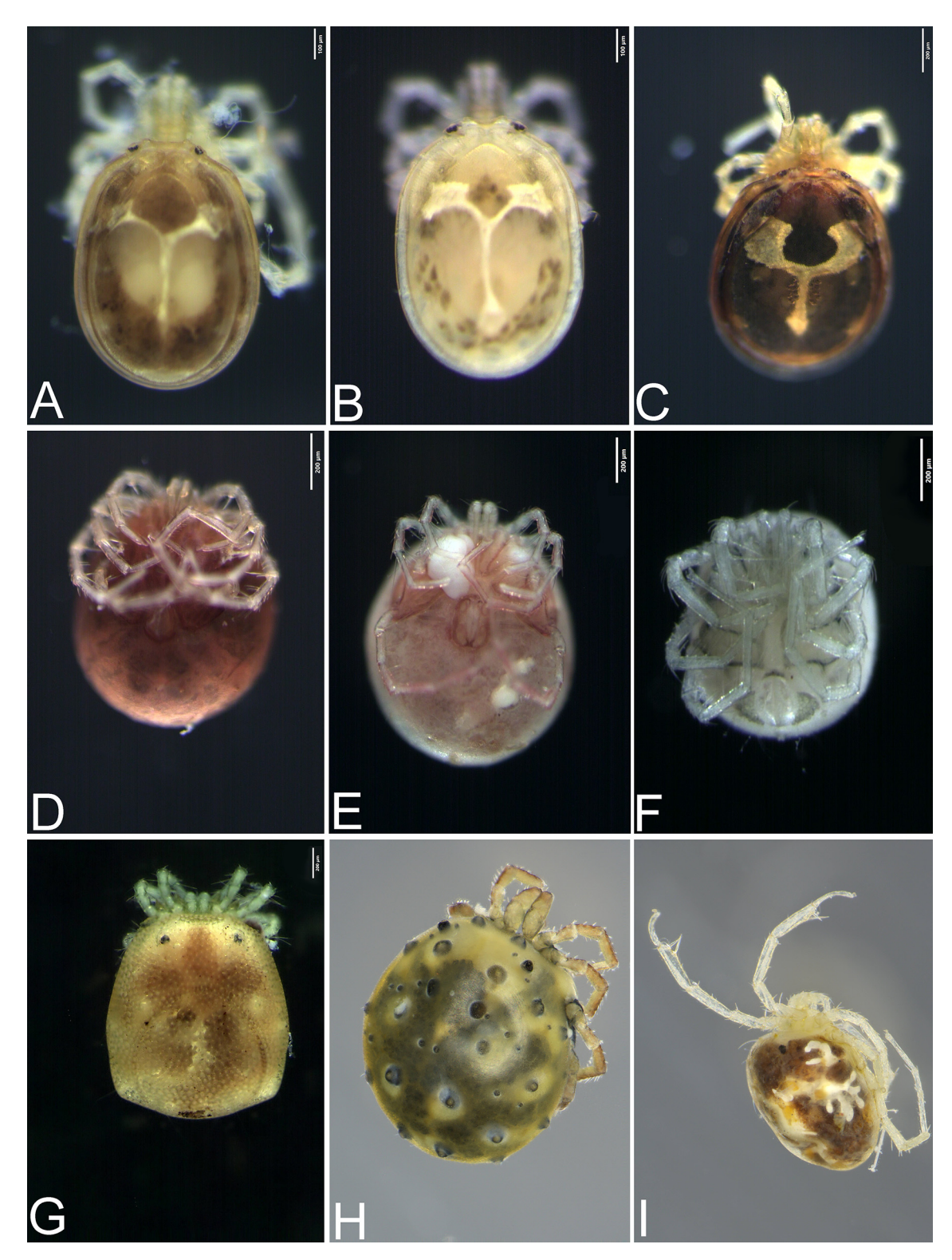
FIGURE 2. Photographs of selected water mite species. A— Torrenticola pharyngealis, Levada da Serra; B— T. elliptiformis, Paul da Serra; C— T. nesiotes, Levada da Serra do Faial. D— Lebertia madericola, Levada da Serra do Faial. E— Limnesia atlantica, Levada da Serra do Faial. F— Neumania atlantida, Levada da Serra do Faial. G— Arrenurus bicuspidator, Porto Santo. H— Sperchon brevirostris, São Jorge. I— Atractides macaronensis, Faja da Ovelha.