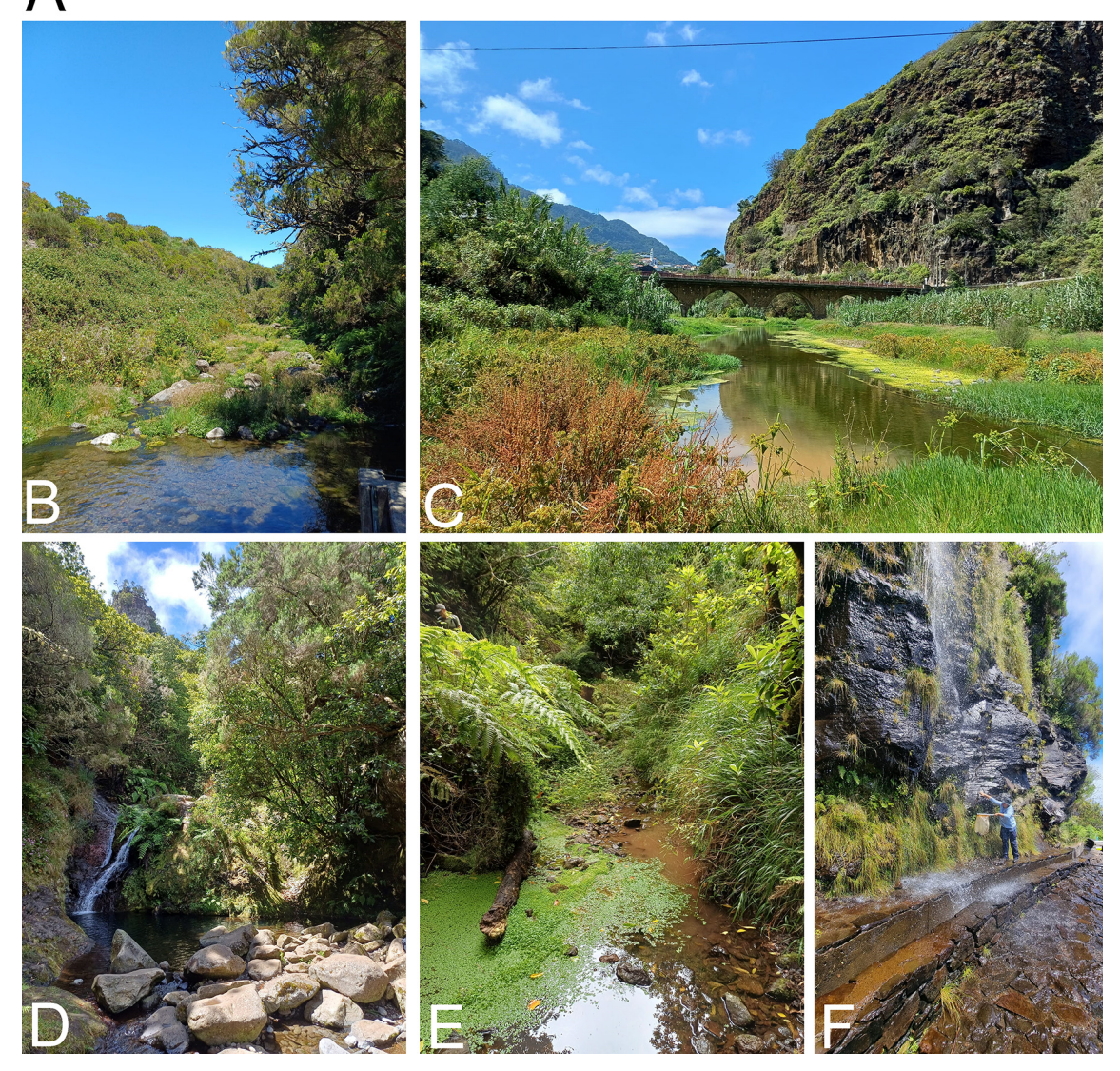
FIGURE 1. A Map of Madeira Archipelago with marked sampling sites. B–F Photographs of selected sampling sites: B– Rabaçal; C—Faial stream; D—Ribeiro frio waterfal; E—Levada da Serra do Faial; F—Levada da Serra waterfal.