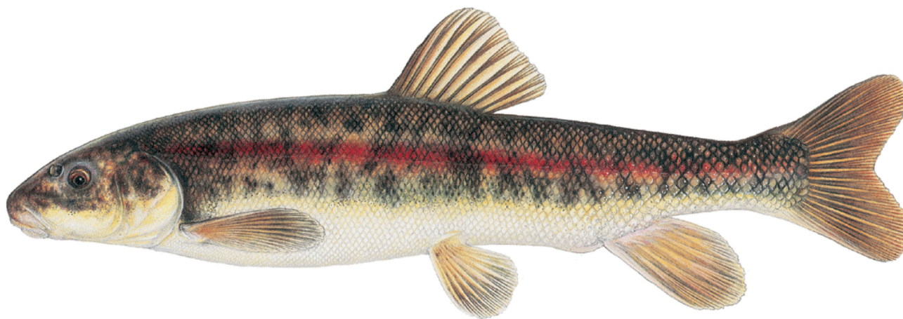
FIGURE 2. Catostomus murivallis , paratype, OS 17569, breeding female, 202 mm SL.

The fossil Miocene and Pliocene sucker of the Snake River Plain and Pliocene Honey Lake, † Ca. shoshonensis , shares a diagnostic maxilla shape with Ca. murivallis according to Smith et al. (2002). They also noted that hydrographic cycles in the Great Basin should have led to many opportunities for allopatric speciation, but that desiccation cycles have apparently been so severe that extinction has dominated. If the Ca. murivallis - Ca. warnerensis clade has persisted since the Miocene, the relatively low sequence divergence suggests that only a more recent allopatric event can be detected. This is reflected in molecular differentiation and molecular phylogenetic divergence time estimation (Supplemental Figure S1) that indicates a divergence during the Pleistocene.